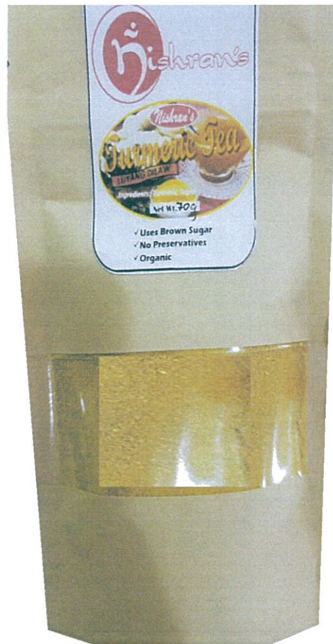
Figure 3. Unregistered NISHRAN'S Instant Turmeric Tea Luyang Dilaw