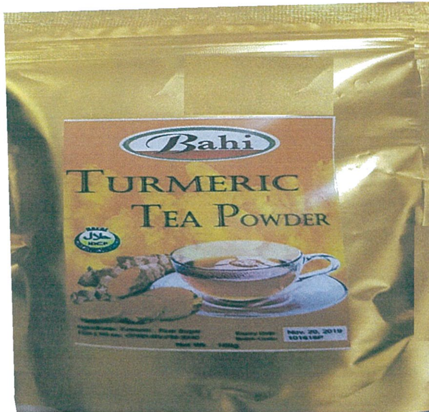
Figure 1. Unregistered BAHI Turmeric Tea Powder

The Food and Drug Administration (FDA) warns the public from purchasing and consuming the following unregistered food products: