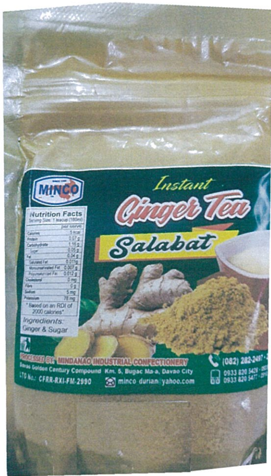
Figure 2. Unregistered Instant Ginger Tea Salabat