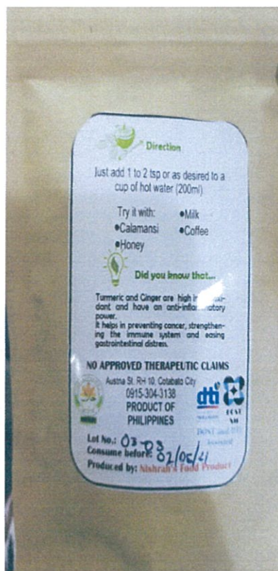
Figure 4. Unregistered NISHRAN'S Salabat Ginger Tea with Turmeric