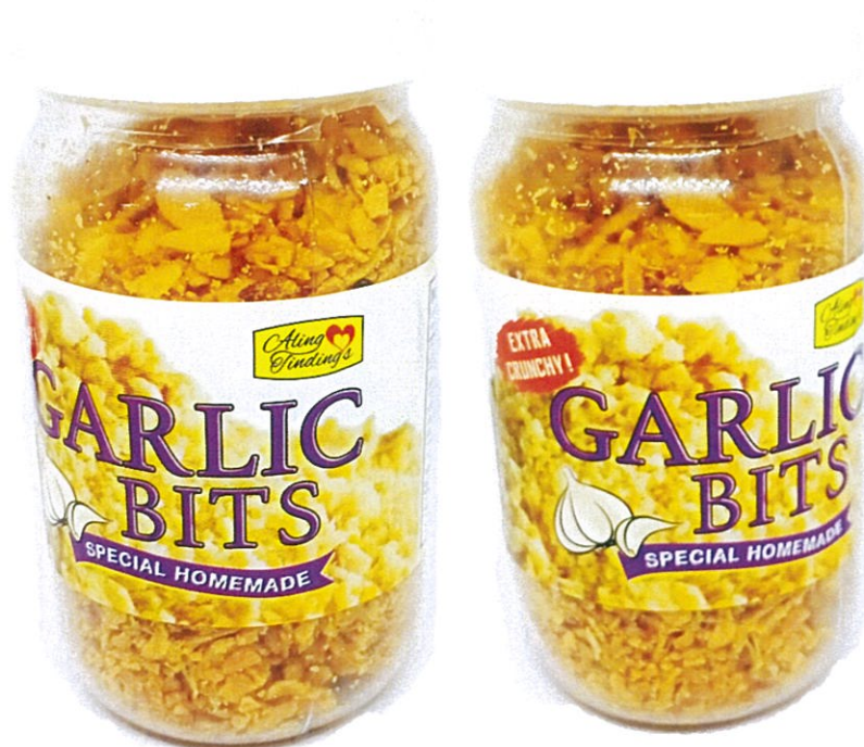
Figure 5. Unregistered ALING TINDING'S Extra Crunchy Garlic Bits