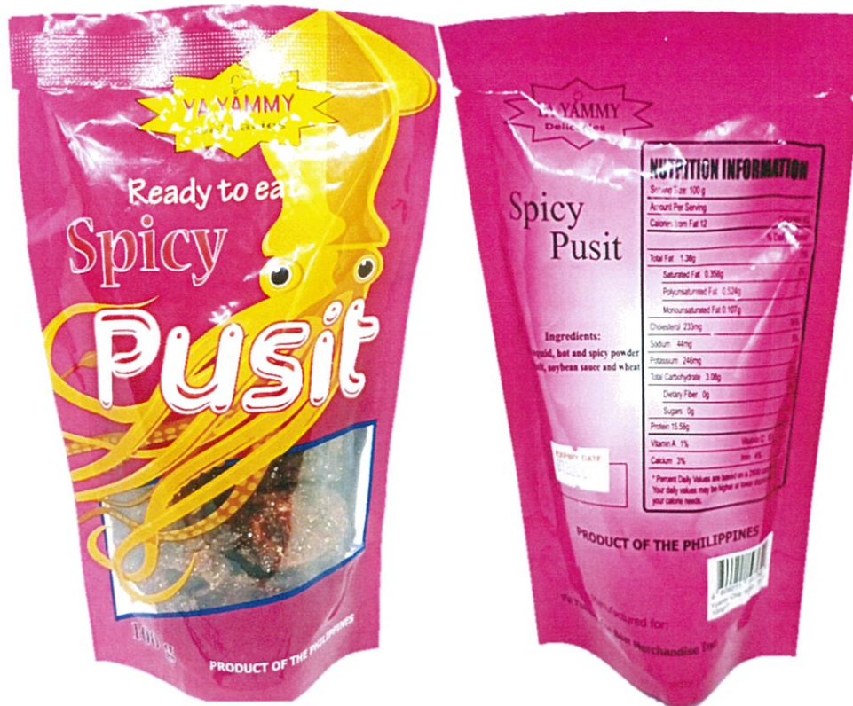
Figure 3. Unregistered YA YAMMY DELICACIES Ready to Eat Spicy Pusit