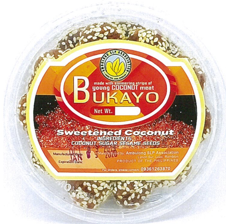
Figure 1. Unregistered AMBULONG SLP ASSOCIATION Young Coconut Meat Bukayo Sweetened Coconut

The Food and Drug Administration (FDA) warns the public from purchasing and consuming the following unregistered food products: