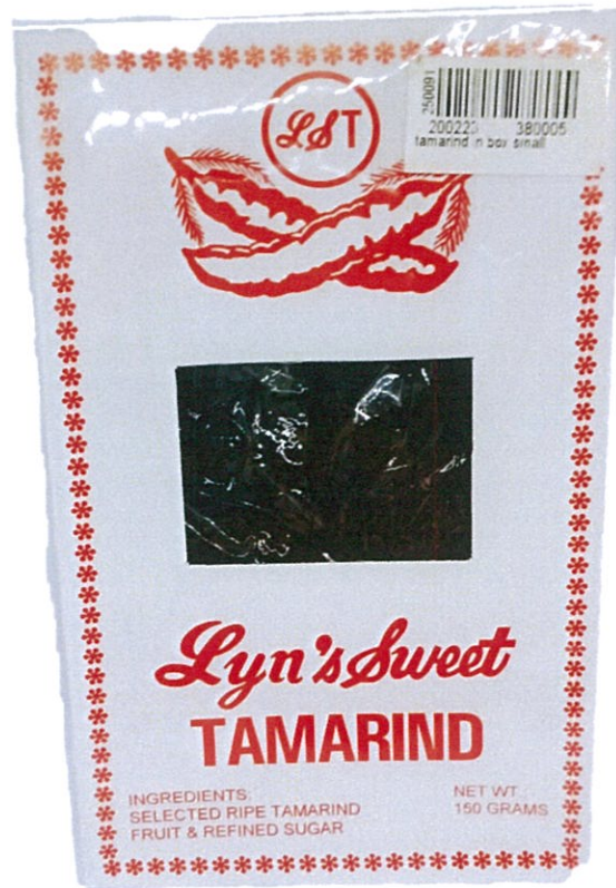
Figure 4. Unregistered L&T LYN'S Sweet Tamarind