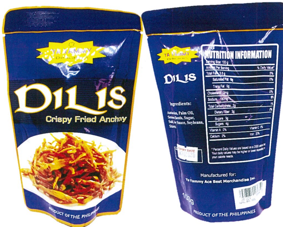
Figure 2. Unregistered YA YAMMY DELICACIES Dilis Crispy Fried Anchovy