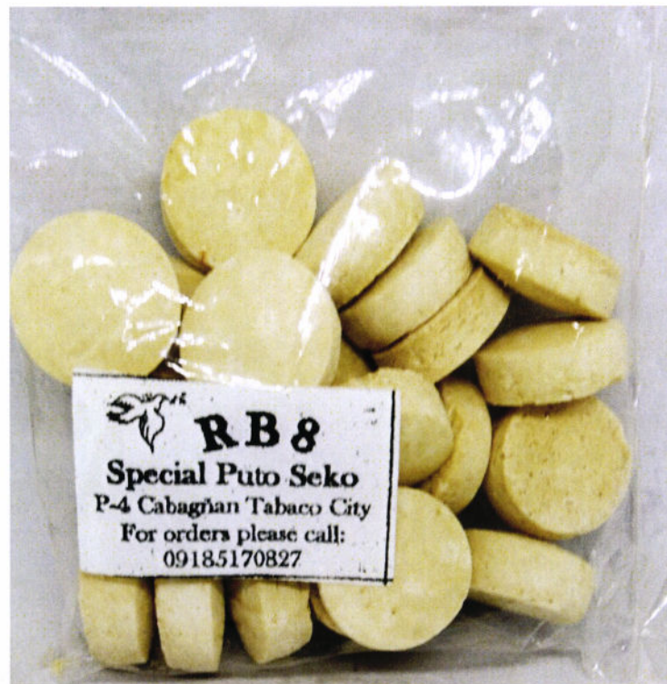
Figure 1. Unregistered RB8 Special Puto Seko

The Food and Drug Administration (FDA) warns the public from purchasing and consuming the following unregistered food products: