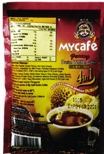
Figure 4. Unregistered COFFEE TREE MYCAFE Penang Durian White Coffee 4in1 (40 grams)