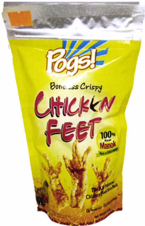
Figure 2. Unregistered POGS! Boneless Crispy Chicken Feet (32 grams)