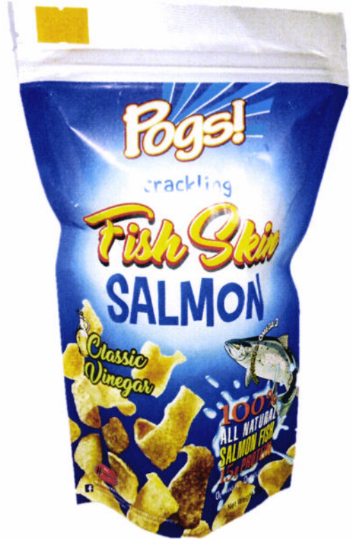
Figure 3. Unregistered POGS! Cracking Fish Skin Salmon (32 grams)