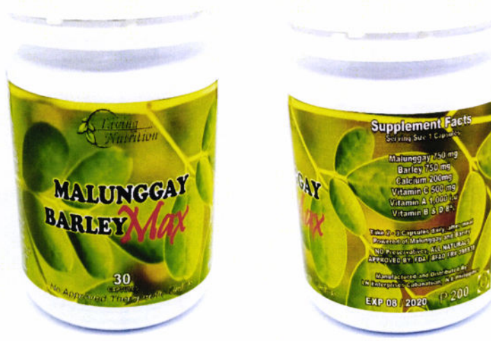
Figure 5. Unregistered LIVING NUTRITION Malunggay Barley Max Dietary Supplement Capsules (30 capsules)