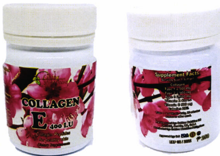
Figure 3. Unregistered LIVING NUTRITION Collagen E 400 I.U. Collagen Peptides Dietary Supplement Softgel (30 Softgels)