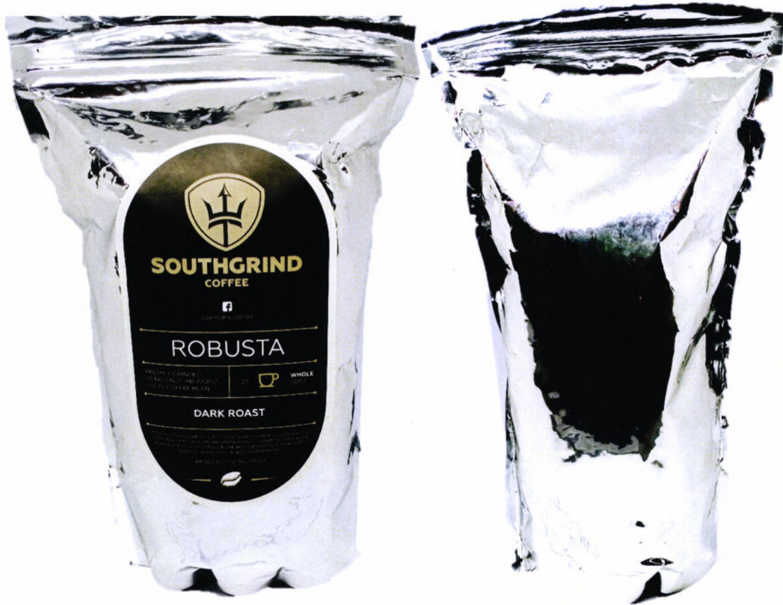
Figure 2. Unregistered SOUTHGRIND Coffee Robusta Dark Roast (200 grams)