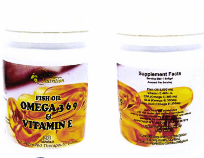
Figure 4. Unregistered LIVING NUTRITION Fish Oil Omega 3,6,9 & Vitamin E Dietary Supplement Softgels (30 Softgels)