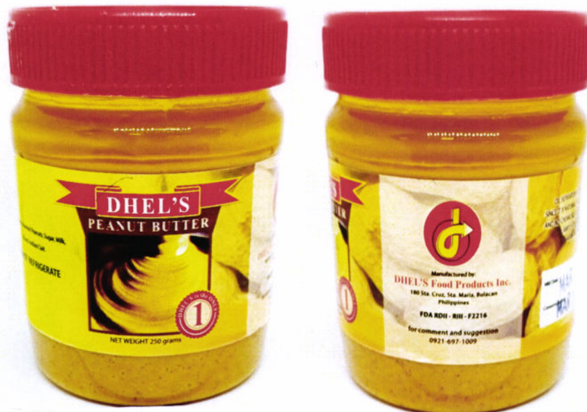
Figure 1. Unregistered DHEL'S Peanut Butter (250 grams)

The Food and Drug Administration (FDA) warns the public from purchasing and consuming the following unregistered food products & food supplements: