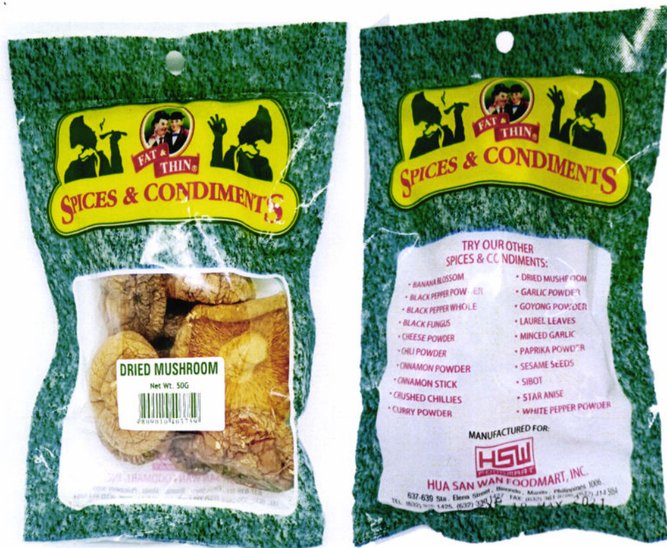
Figure 4. Unregistered FAT & THIN SPICES & CONDIMENTS Dried Mushroom (50 grams)