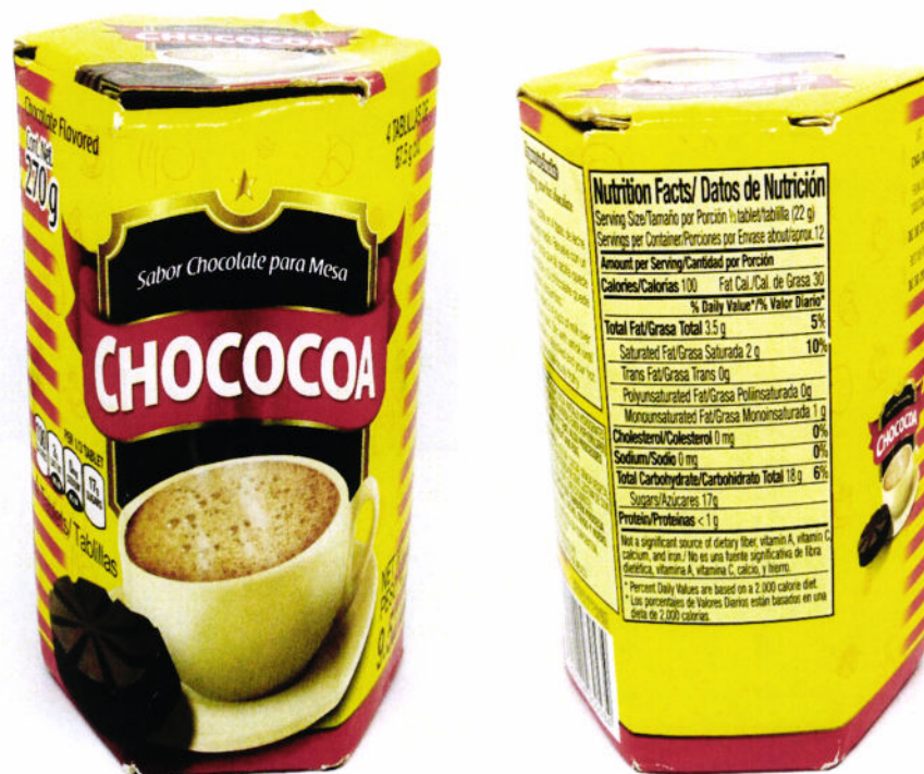
Figure 1. Unregistered CHOCOCOA Sabor Chocolate para Mesa

The Food and Drug Administration (FDA) warns the public from purchasing and consuming the following unregistered food products: