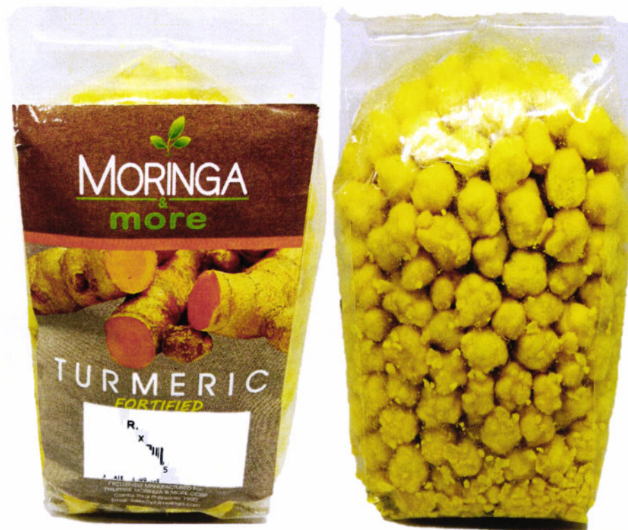
Figure 5. MORINGA & MORE Turmeric Fortified Cornsnax