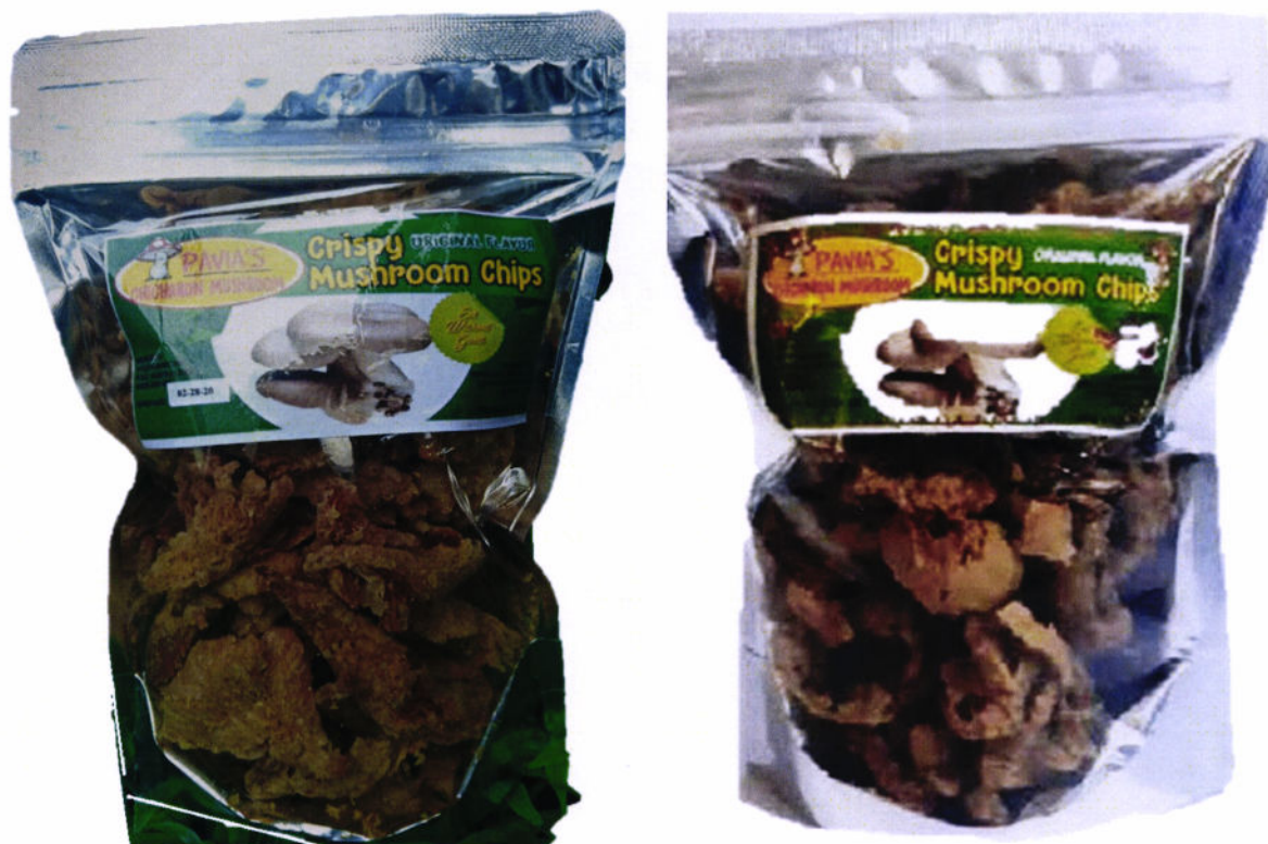
Figure 2. Unregistered PAVIA'S Crispy Mushroom Chips – Original Flavor