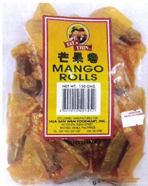
Figure 3. Unregistered FAT & THIN Mango Rolls