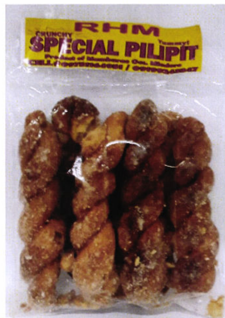
Figure 5. Unregistered RHM Crunchy Special Pilipit

The FDA verified through post-marketing surveillance that the abovementioned food products and food supplement are not registered and the Certificate of Product Registration (CPR) have not yet been issued. Pursuant to the Republic Act No. 9711, otherwise known as the “Food and Drug Administration Act of 2009”, the manufacture, importation, exportation, sale, offering for sale, distribution, transfer, non-consumer use, promotion, advertising or sponsorship of health products without the proper authorization is prohibited.