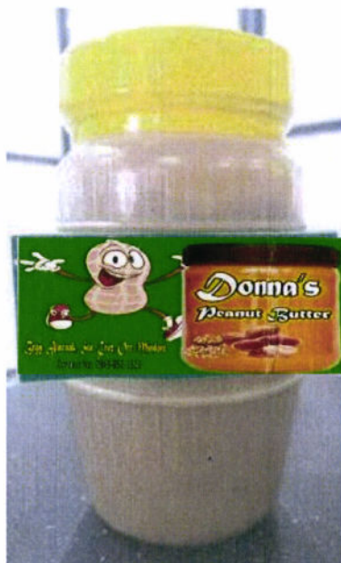
Figure 4. Unregistered DONNA'S Peanut Butter