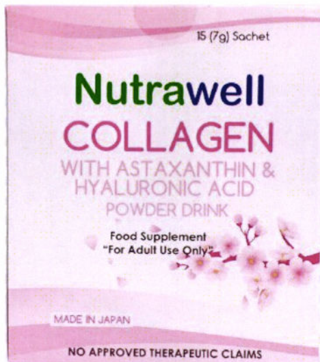
Figure 2. Unregistered NUTRAWELL Collagen with Astaxanthin & Hyaluronic Acid Food Supplement Powder Drink