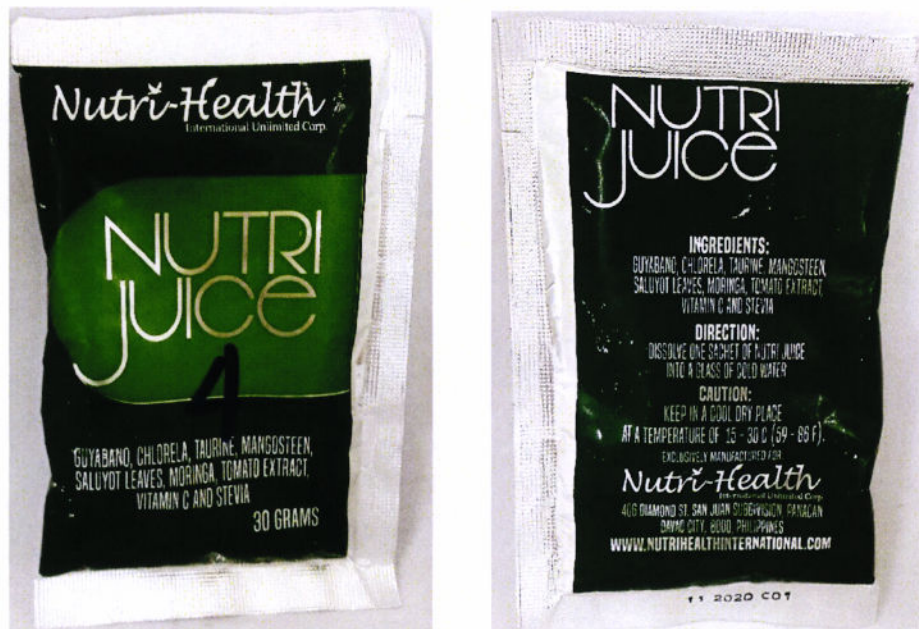
Figure 1. Unregistered NUTRI JUICE Nutri-Health International Unlimited Corp. Guyabano, Chlorela, Taurine, Mangosteen, Saluyot Leaves, Moringa, Tomato Extract, Vitamin C and Stevia

The Food and Drug Administration (FDA) warns the public from purchasing and consumption of the following unregistered food products and food supplement: