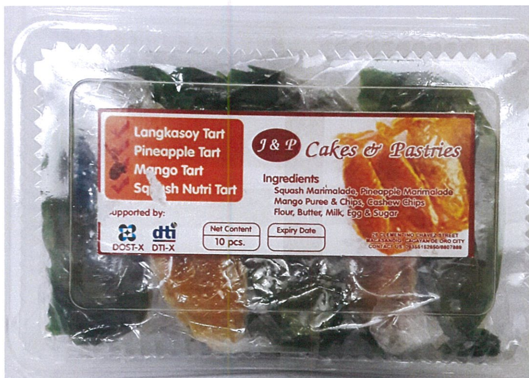
Figure 1. Unregistered J & P CAKES & PASTRIES Mango Tart

The Food and Drug Administration (FDA) warns the public from purchasing and consumption of the following unregistered food products: