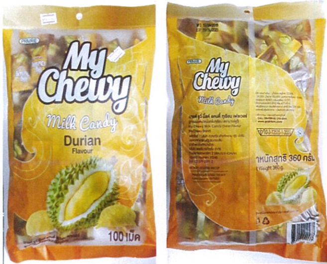
Figure 2. Unregistered MY CHEWY Milk Candy Durian Flavor