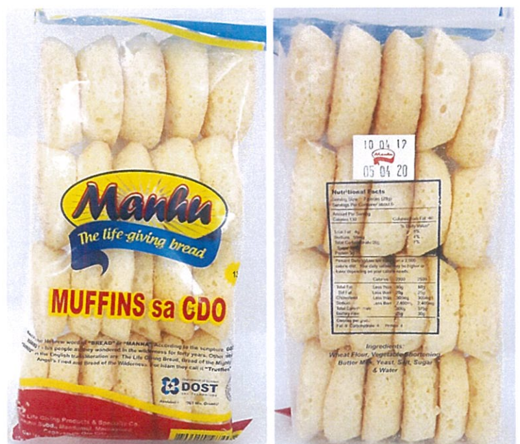
Figure 5. Unregistered MANHU the Life-Giving Bread Muffins sa CDO

The FDA verified through post-marketing surveillance that the abovementioned food products are not registered and the Certificate of Product Registration (CPR) have not yet been issued. Pursuant to the Republic Act No. 9711, otherwise known as the "Food and Drug Administration Act of 2009", the manufacture, importation, exportation, sale, offering for sale, distribution, transfer, non-consumer use, promotion, advertising or sponsorship of health products without the proper authorization is prohibited.