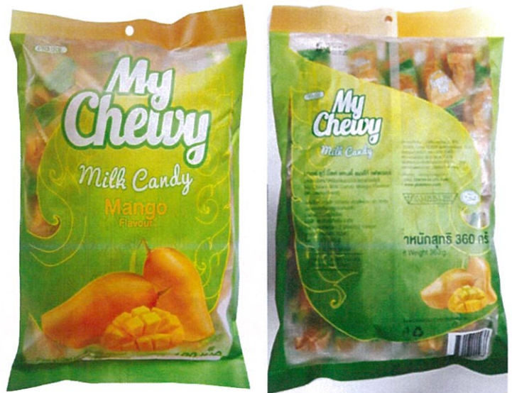
Figure 3. Unregistered MY CHEWY Milk Candy Mango Flavor