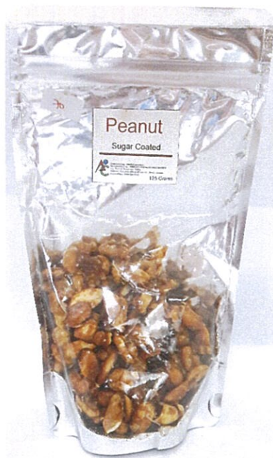
Figure 4. Unregistered Peanut Sugar Coated