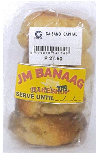
Figure 5. Unregistered JM BANAAG BAKESHOP Hopia

The FDA verified through post-marketing surveillance that the abovementioned food products and food supplement are not registered and the Certificate of Product Registration (CPR) have not yet been issued. Pursuant to the Republic Act No. 9711, otherwise known as the “Food and Drug Administration Act of 2009”, the manufacture, importation, exportation, sale, offering for sale, distribution, transfer, non-consumer use, promotion, advertising or sponsorship of health products without the proper authorization is prohibited.