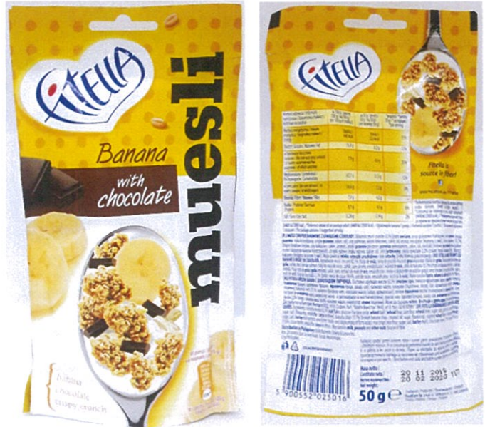
Figure 3. Unregistered FITELLA Muesli Banana with Chocolate