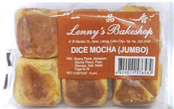
Figure 4. Unregistered LENNY'S BAKESHOP Dice Mocha (Jumbo)