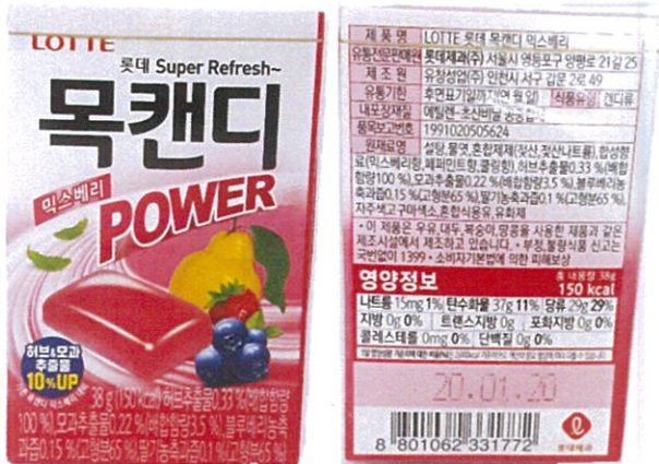
Figure 2. Unregistered LOTTE Super Refresh Power (Throat Candy Herb Flavor)