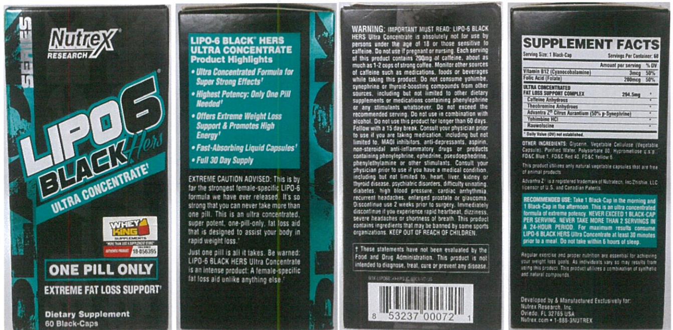
Figure 1. Unregistered NUTREX® RESEARCH LIPO6® Black Hers Ultra Concentrate Extreme Fat Loss Support

The Food and Drug Administration (FDA) warns the public from purchasing and consumption of the following unregistered food products and food supplement: