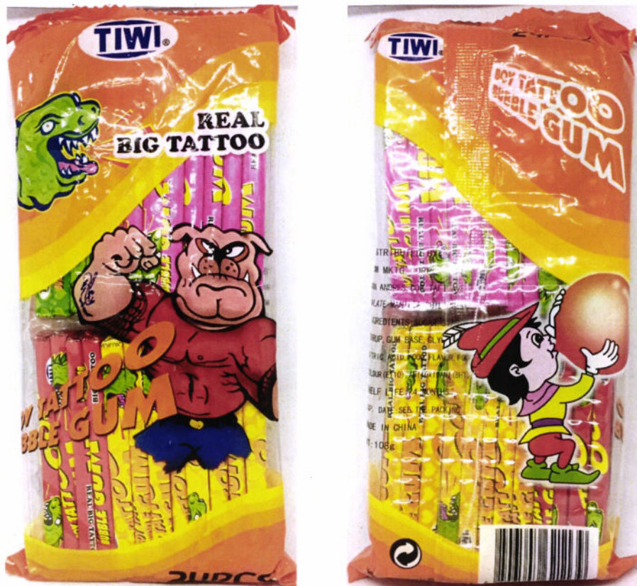
Figure 1. Unregistered TIWI Real Big Tattoo Boy Tattoo Bubble Gum

The Food and Drug Administration (FDA) warns the public from purchasing and consuming the following unregistered food products: