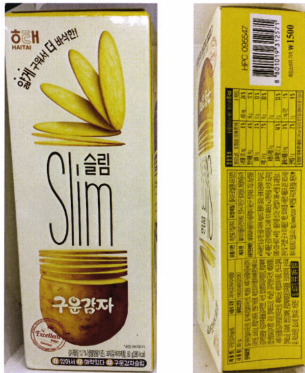
Figure 5. Unregistered HAITAI Slim Potato Chips (in foreign characters)