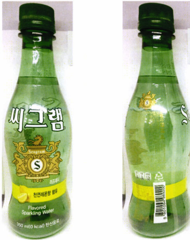
Figure 4. Unregistered SEAGRAM'S Flavored Sparkling Water