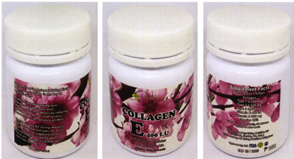
Figure 5. Unregistered LIVING NUTRITION Collagen E 400 I.U.

The FDA verified through post-marketing surveillance that the abovementioned food product and food supplements are not authorized and the Certificates of Product Registration (CPR) have not been issued. Pursuant to the Republic Act No. 9711, otherwise known as the “Food and Drug Administration Act of 2009”, the manufacture, importation, exportation, sale, offering for sale, distribution, transfer, non-consumer use, promotion, advertising or sponsorship of health products without the proper authorization is prohibited.