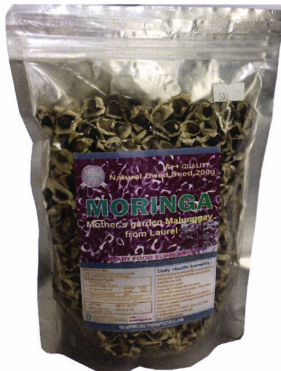
Figure 1. Unregistered Natural Dried Seed Moringa Mother's Garden Malunggay from Laurel Dietary Food Supplement

The Food and Drug Administration (FDA) warns the public from purchasing and consuming the following unregistered food product and food supplements: