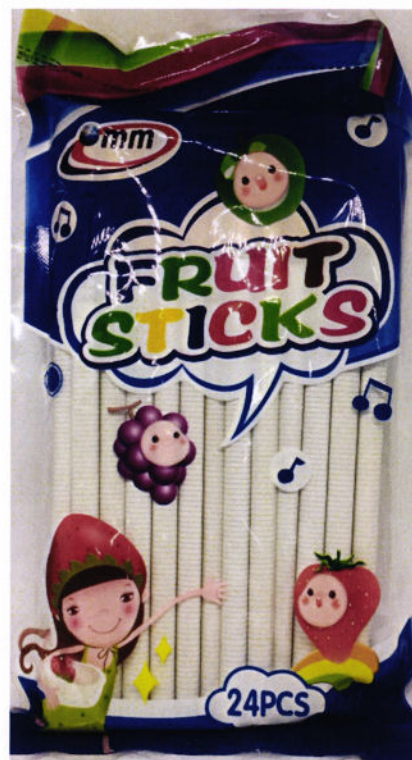
Figure 3. Unregistered MM Fruit Sticks