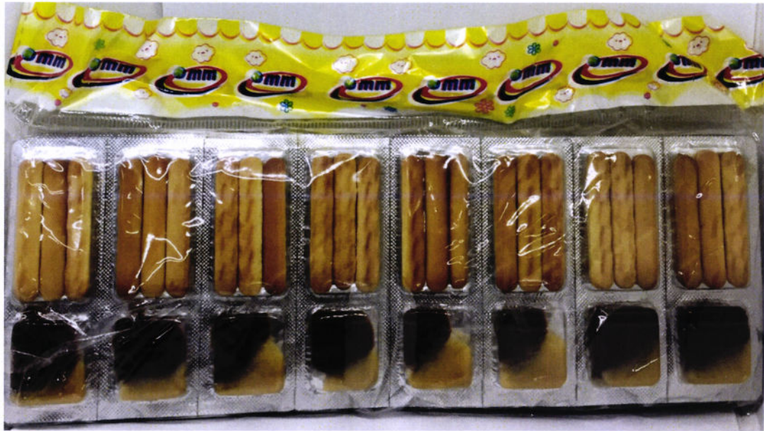
Figure 4. Unregistered MM Choco Funstix