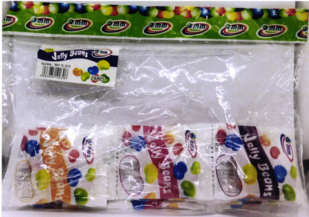
Figure 2. Unregistered MM Jelly Beans