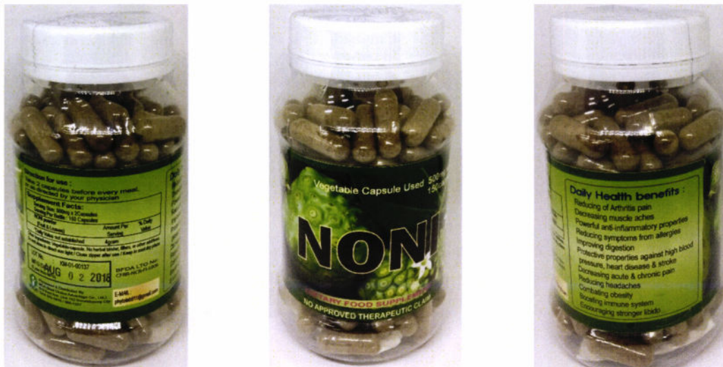
Figure 4. Unregistered NONI Dietary Food Supplement