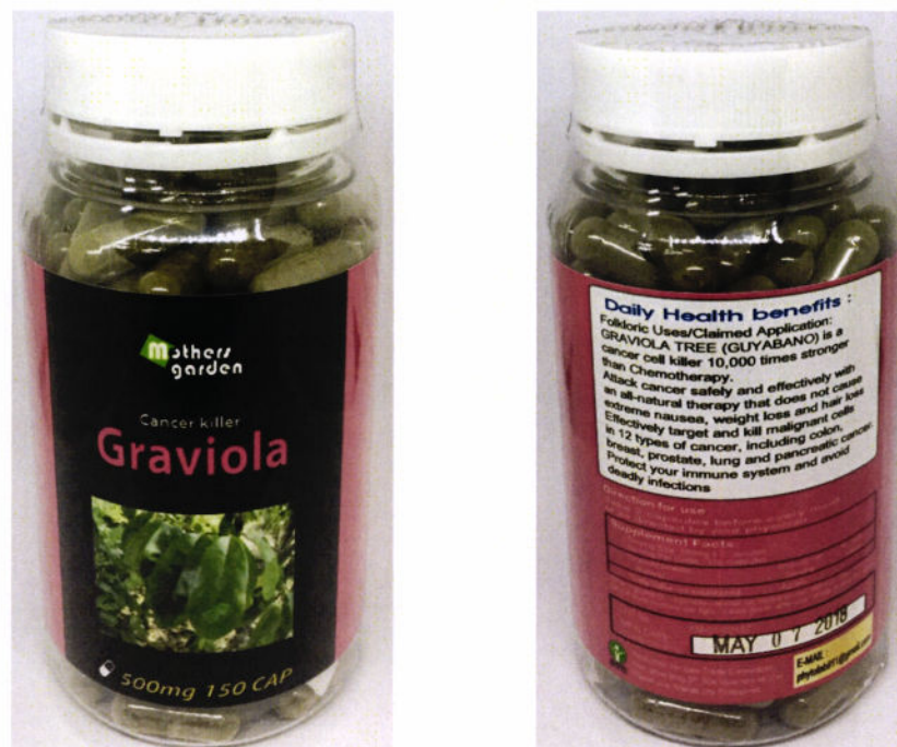
Figure 3. Unregistered MOTHERS GARDEN Cancer Killer Graviola