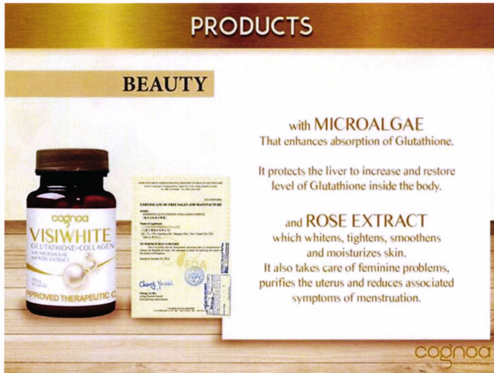
Figure 2. Unregistered COGNOA VISIWHITE Glutathione + Collagen with Microalgae and Rose Extract Food Supplement