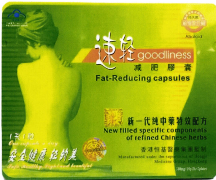
Figure 1. Unregistered GOODLINESS Fat-Reducing Capsules

The Food and Drug Administration (FDA) warns the public from purchasing and consuming the following unregistered food supplements: