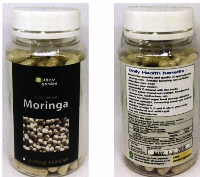
Figure 5. Unregistered MOTHERS GARDEN Body Detoxe Moringa

The FDA verified through post-marketing surveillance that the abovementioned food supplements are not authorized and the Certificates of Product Registration (CPR) have not been issued. Pursuant to the Republic Act No. 9711, otherwise known as the “Food and Drug Administration Act of 2009”, the manufacture, importation, exportation, sale, offering for sale, distribution, transfer, non-consumer use, promotion, advertising or sponsorship of health products without the proper authorization is prohibited.