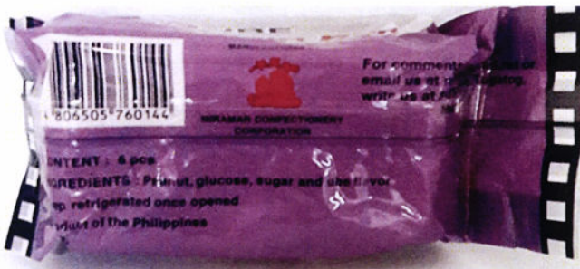
Figure 4. Unregistered Ube Peanut Bar Special