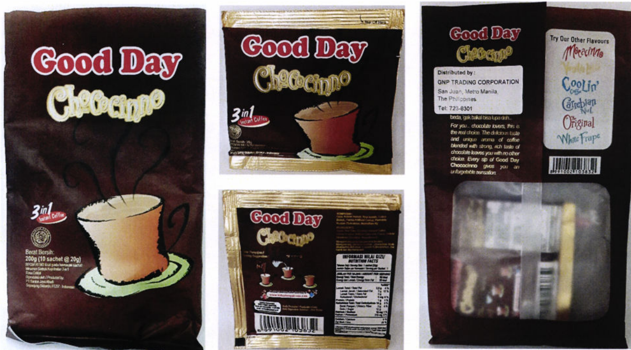
Figure 1. Unregistered GOOD DAY Chococinno 3in1 Instant Coffee

The Food and Drug Administration (FDA) warns the public from purchasing and consumption of the following unregistered food products: