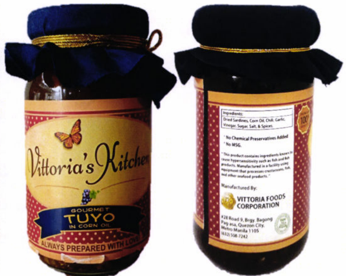
Figure 5. Unregistered VITTORIA'S KITCHEN Gourmet Tuyo in Corn Oil

The FDA verified through post-marketing surveillance that the abovementioned food products are not registered and the Certificate of Product Registration (CPR) have not yet been issued. Pursuant to the Republic Act No. 9711, otherwise known as the "Food and Drug Administration Act of 2009", the manufacture, importation, exportation, sale, offering for sale, distribution, transfer, non-consumer use, promotion, advertising or sponsorship of health products without the proper authorization is prohibited.