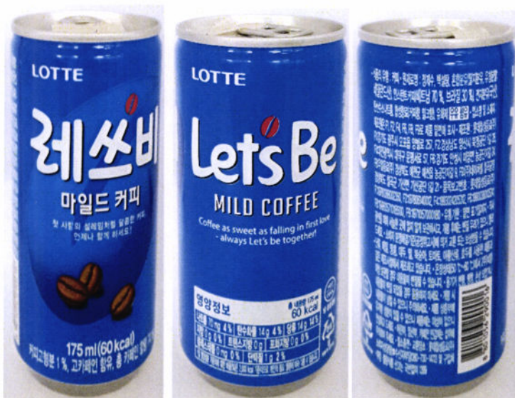
Figure 4. Unregistered LOTTE Let's Be Mild Coffee