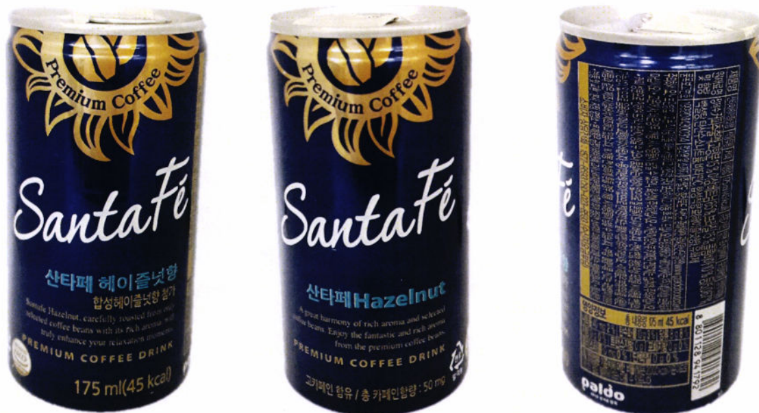
Figure 1. Unregistered SANTA FE Premium Coffee Drink

The Food and Drug Administration (FDA) warns the public from purchasing and consumption of the following unregistered food products: