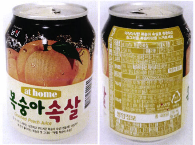
Figure 3. Unregistered At Home Crushed Peach Juice