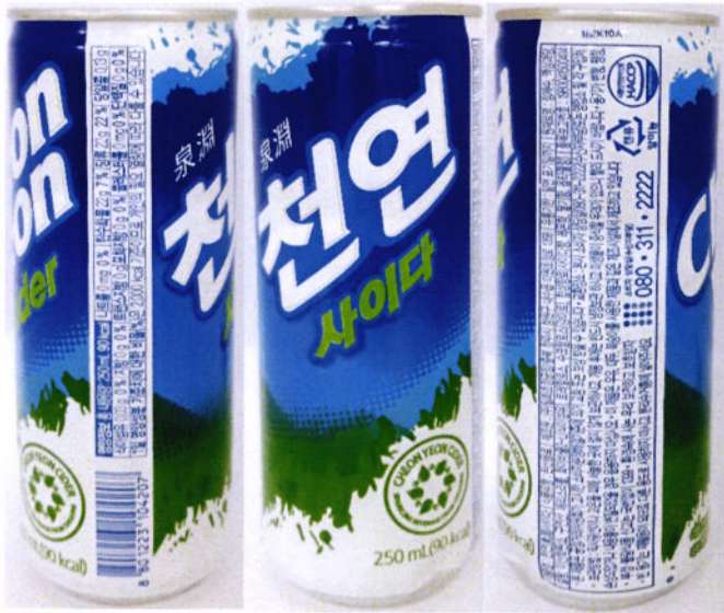
Figure 2. Unregistered CHEON YEON Cider