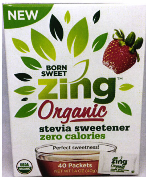
Figure 4. Unregistered BORN SWEET ZING ORGANIC Stevia Sweetener Zero Calories 1 box x 40 packets