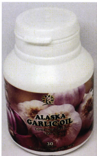
Figure 1. Unregistered LIVING NUTRITION Alaska Garlic Oil Food Supplement Softgel

The Food and Drug Administration (FDA) warns the public from purchasing and consuming the following unregistered food product and food supplements: