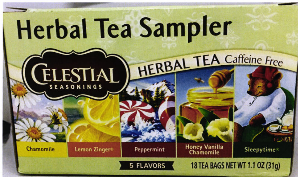
Figure 3. Unregistered CELESTIAL SEASONINGS Herbal Tea Caffeine Free (Herbal Tea Sampler-5 Flavors) 1 Box x 18 Tea bags