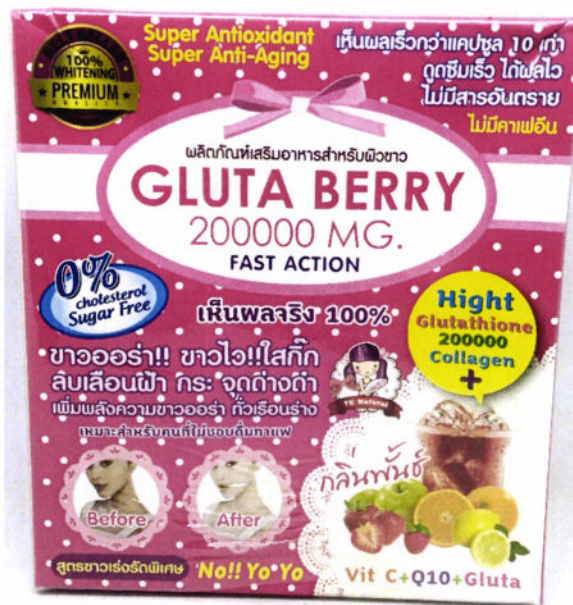
Figure 5. Unregistered GLUTA BERRY 200000 MG Fast Action