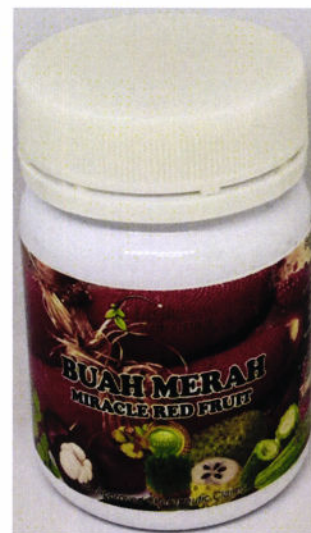
Figure 2. Unregistered LIVING NUTRITION Buah Merah Miracle Red Fruit Food Supplement Capsule