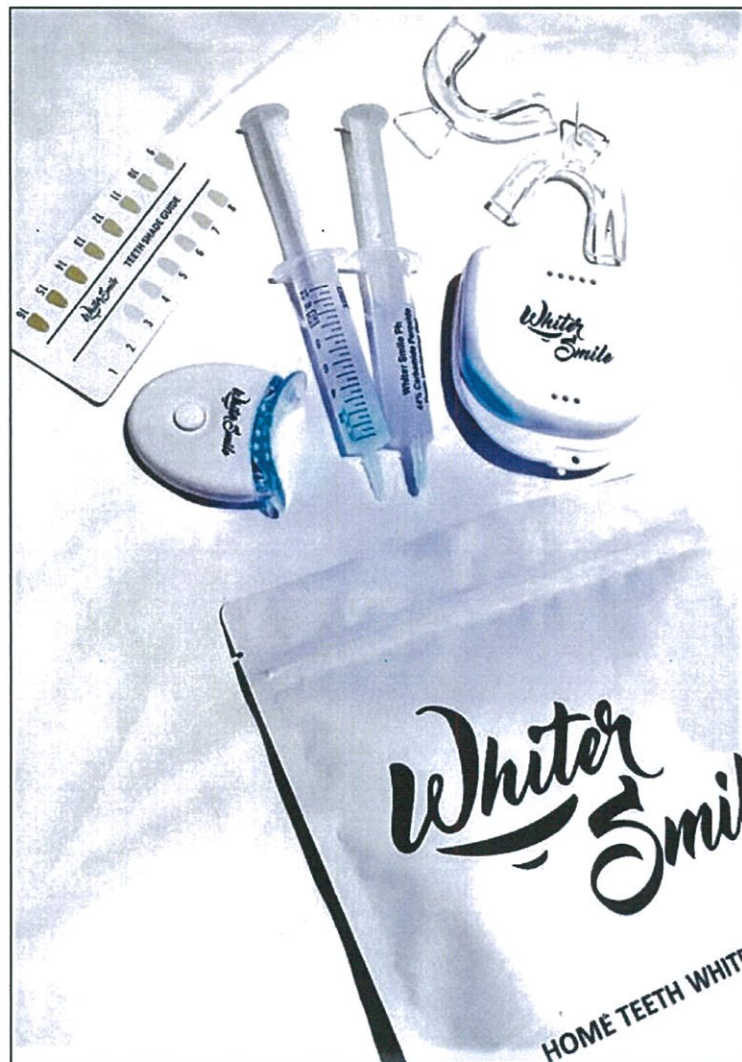
Figure 1. Unregistered Whiter Smile Home Teeth Whitening Kit

The Food and Drug Administration (FDA) warns all healthcare professionals and the general public against the purchase and use of the unregistered medical device: