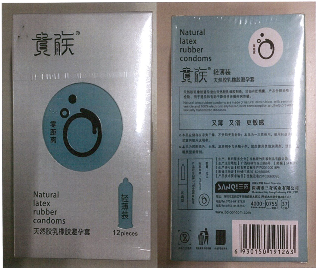
Figure 2. Unregistered Noble Latex Rubber Condoms

The FDA verified through post-marketing surveillance that the abovementioned medical devices are not registered and the Certificates of Product Registration (CPR) have not yet been issued. Pursuant to the Republic Act No. 9711, otherwise known as the “Food and Drug Administration Act of 2009”, the manufacture, importation, exportation, sale, offering for sale, distribution, transfer, non-consumer use, promotion, advertising or sponsorship of health products without the proper authorization is prohibited.