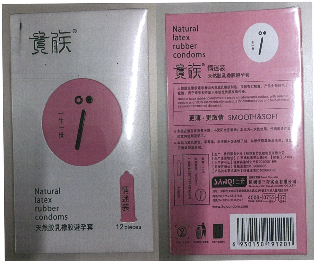
Figure 1. Unregistered Noble Latex Rubber Condoms

The Food and Drug Administration (FDA) warns the general public and all healthcare professionals against the purchase and use of the unregistered medical devices: