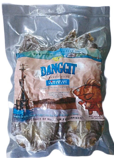
Figure 5. Unregistered NEHEMIAH SUPERFOOD Danggit (Rabbit Fish)

The FDA verified through post-marketing surveillance that the abovementioned food products are not authorized and the Certificates of Product Registration (CPR) have not been issued. Pursuant to the Republic Act No. 9711, otherwise known as the “Food and Drug Administration Act of 2009”, the manufacture, importation, exportation, sale, offering for sale, distribution, transfer, non-consumer use, promotion, advertising or sponsorship of health products without the proper authorization is prohibited.