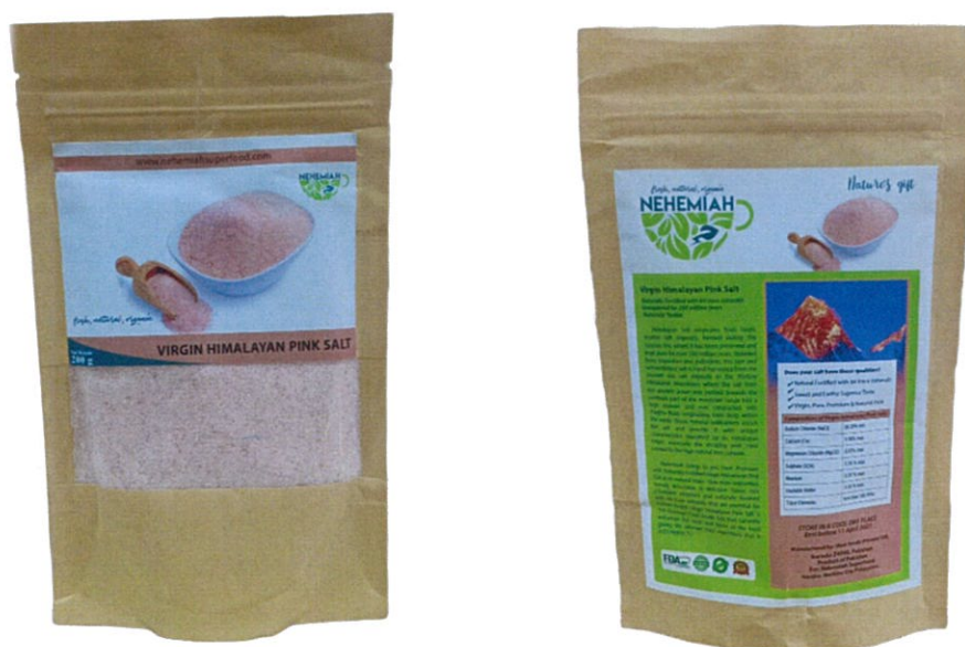
Figure 4. Unregistered NEHEMIAH Virgin Himalayan Pink Salt