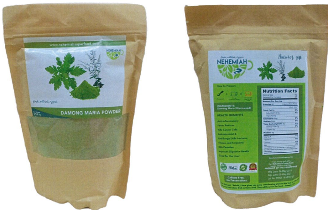
Figure 2. Unregistered NEHEMIAH Damong Maria Powder