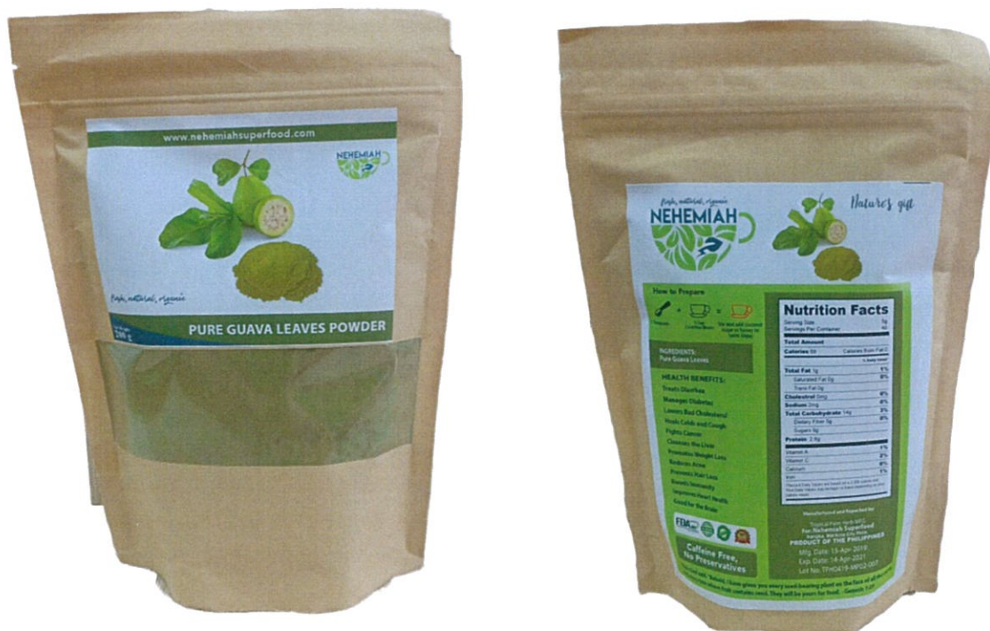
Figure 3. Unregistered NEHEMIAH Pure Guava Leaves Powder