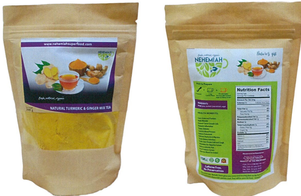
Figure 1. Unregistered NEHEMIAH SUPERFOOD Natural Turmeric & Ginger Mix Tea

The Food and Drug Administration (FDA) advises the public from purchasing and consuming the following unregistered food products: