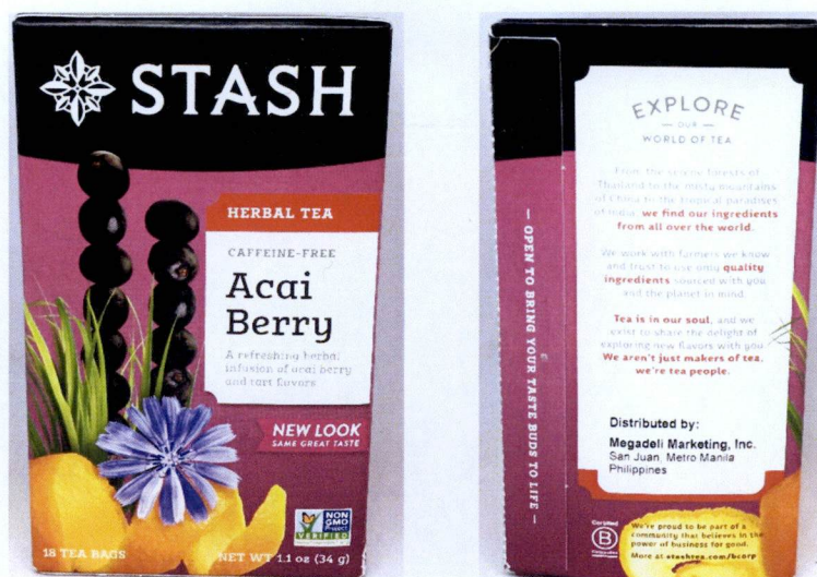
Figure 4. Unregistered STASH Herbal Tea Acai Berry 34g