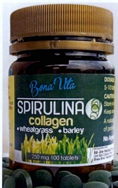
Figure 1. Unregistered BONA VITA Spirulina Tablets

The Food and Drug Administration (FDA) warns the public from purchasing and consuming the following unregistered food products and food supplements: