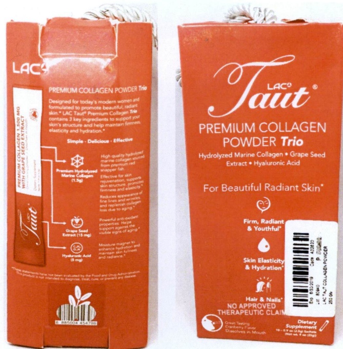
Figure 2. Unregistered LAC TAUT Premium Collagen 1500mg with Grape Seed Extract Dietary Supplement Powder