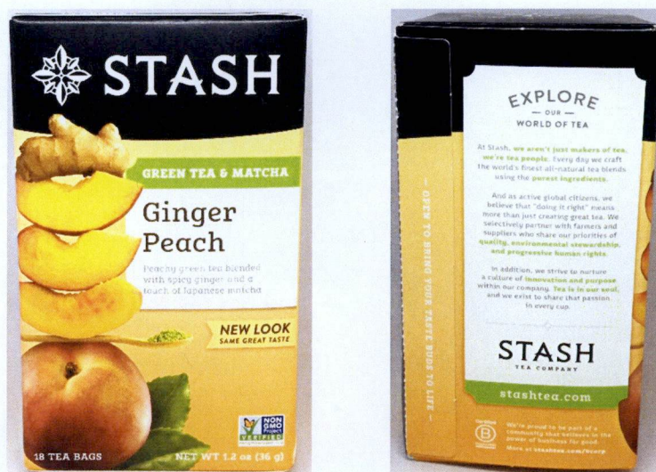
Figure 5. Unregistered STASH Green Tea & Matcha Ginger Peach 36g

The FDA verified through post-marketing surveillance that the abovementioned food products and food supplements are not authorized and the Certificates of Product Registration have not been issued. Pursuant to the Republic Act No. 9711, otherwise known as the “Food and Drug Administration Act of 2009”, the manufacture, importation, exportation, sale, offering for sale, distribution, transfer, non-consumer use, promotion, advertising or sponsorship of health products without the proper authorization is prohibited.