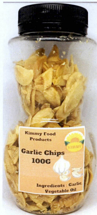
Figure 3. Unregistered KIMMY FOOD PRODUCTS Garlic Chips