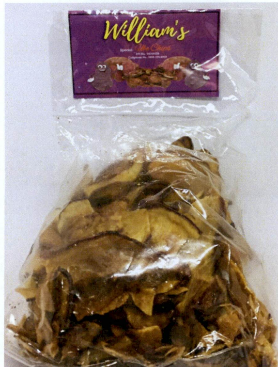
Figure 1. Unregistered WILLIAM'S Ube Chips

The Food and Drug Administration (FDA) warns the public from purchasing and consuming the following unregistered food products: