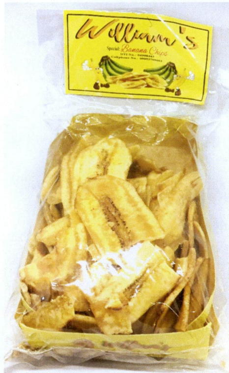
Figure 2. Unregistered WILLIAM'S Banana Chips