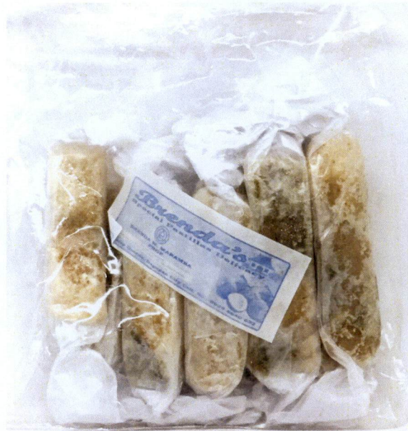
Figure 4. Unregistered BRENDA'S Special Pastillas