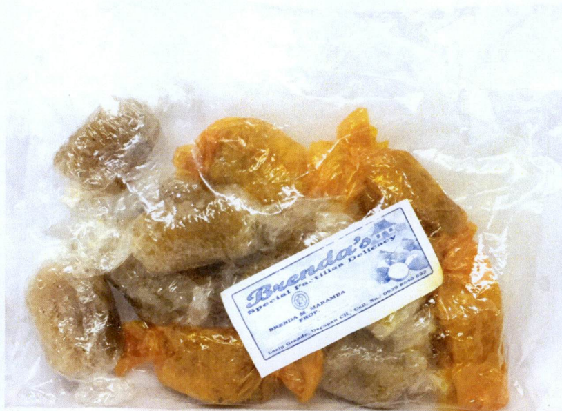
Figure 5. Unregistered BRENDA'S Special Pastillas (Macapuno)

The FDA verified through post-marketing surveillance that the abovementioned food products are not authorized and the Certificates of Product Registration have not been issued. Pursuant to the Republic Act No. 9711, otherwise known as the "Food and Drug Administration Act of 2009", the manufacture, importation, exportation, sale, offering for sale, distribution, transfer, non-consumer use, promotion, advertising or sponsorship of health products without the proper authorization is prohibited.