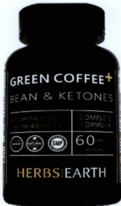
Figure 5. Unregistered HERBS OF THE EARTH Green Coffee + Bean and Ketones Dietary Supplement

The FDA verified through post-marketing surveillance that the above mentioned food supplements and food products are not authorized and the Certificates of Product Registration (CPR) have not been issued. Pursuant to the Republic Act No. 9711, otherwise known as the “Food and Drug Administration Act of 2009”, the manufacture, importation, exportation, sale, offering for sale, distribution, transfer, non-consumer use, promotion, advertising or sponsorship of health products without the proper authorization is prohibited.