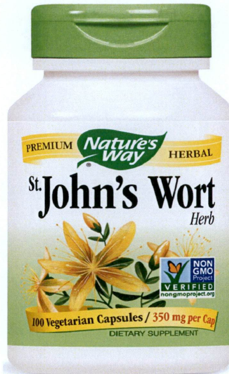
Figure 1: Unregistered NATURE'S WAY St. John's Wort Herb

The Food and Drug Administration (FDA) warns the public from purchasing and consuming the following unregistered food supplements and food products: