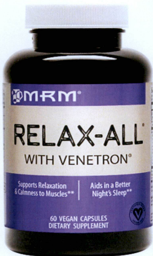
Figure 2. Unregistered MRM Relax- All with Venetron, Dietary Supplement