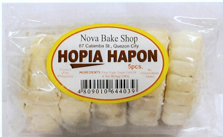
Figure 4. Unregistered Nova Bake Shop Hopia Hapon. 5pcs