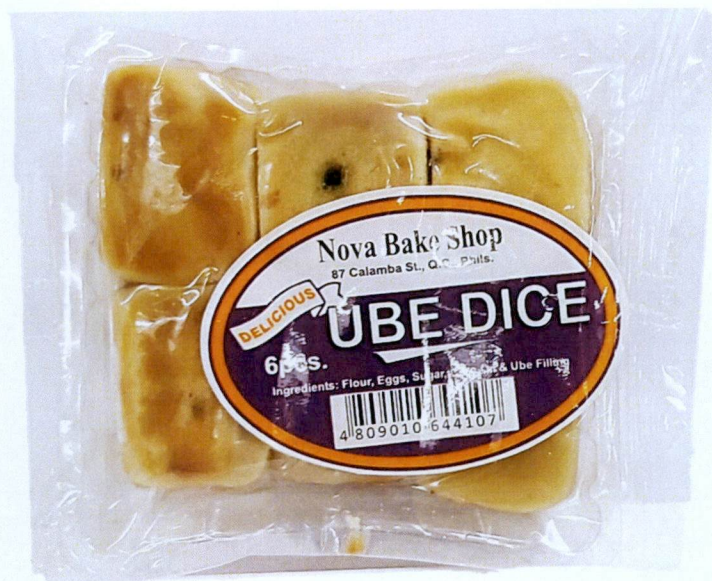
Figure 3. Unregistered Nova Bake Shop Delicious Ube Dice 6 Pcs