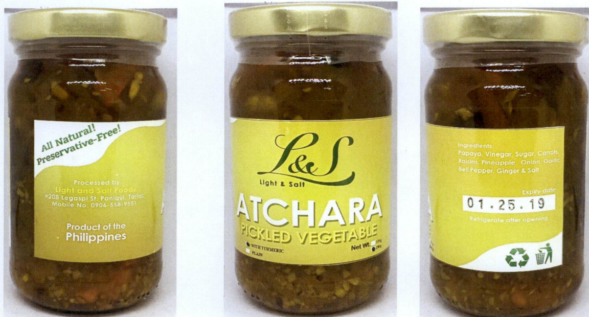
Figure 3. Unregistered L&S Atchara Pickled Vegetable with Turmeric