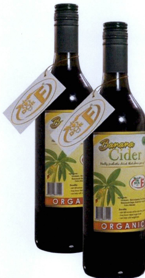
Figure 2. Unregistered DOK F Banana Cider