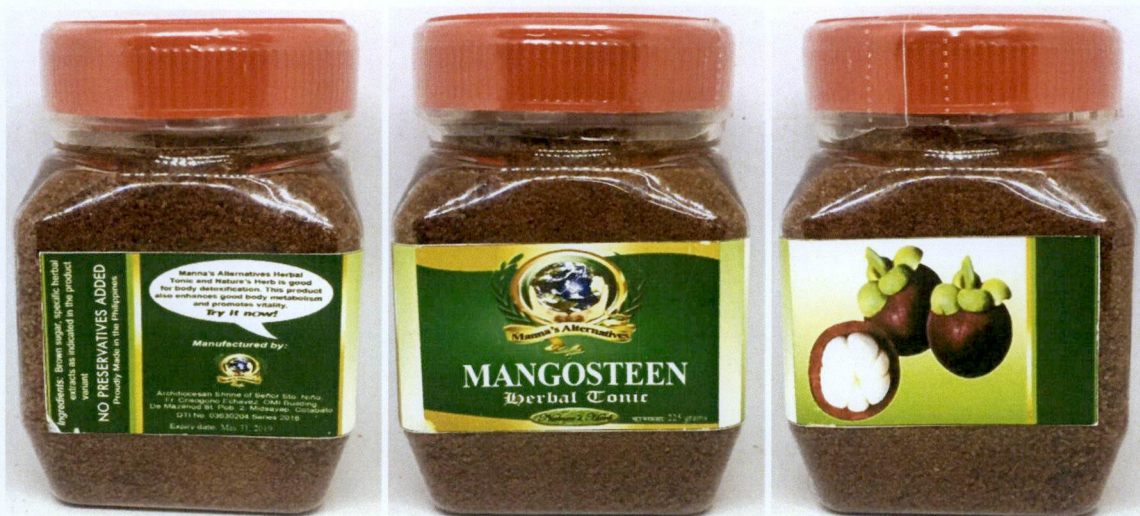
Figure 1. Unregistered MANNA'S ALTERNATIVES Mangosteen Herbal Tonic

The Food and Drug Administration (FDA) warns the public from purchasing and consuming the following unregistered food products: