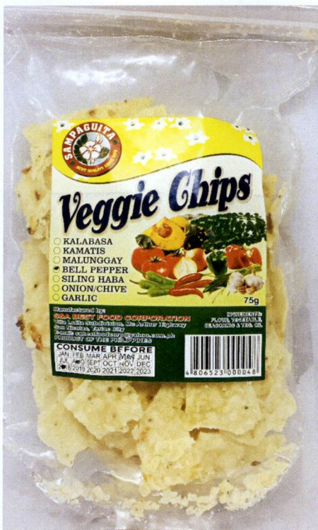
Figure 5. Unregistered SAMPAGUITA Veggie Chips Bell Pepper

The FDA verified through post-marketing surveillance that the abovementioned food products are not authorized and the Certificates of Product Registration have not been issued. Pursuant to the Republic Act No. 9711, otherwise known as the “Food and Drug Administration Act of 2009”, the manufacture, importation, exportation, sale, offering for sale, distribution, transfer,