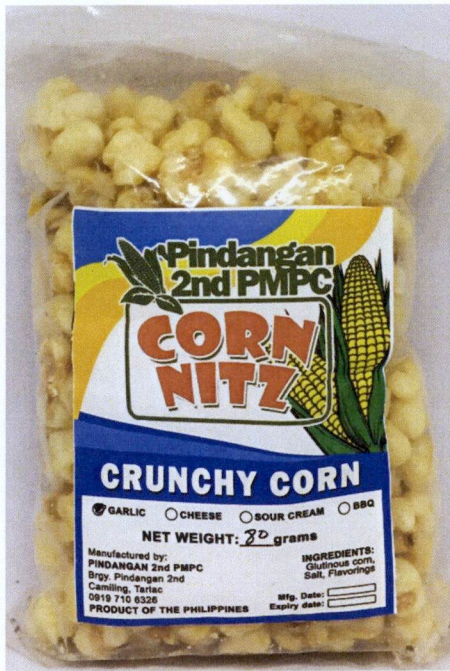
Figure 4. Unregistered PINDANGAN 2nd PMPC Corn Nitz Crunchy Corn Garlic