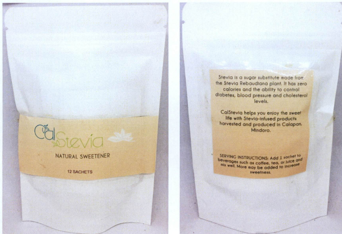
Figure 1. Unregistered CALSTEVIA Natural Sweetener

The Food and Drug Administration (FDA) warns the public from purchasing and consuming the following unregistered food products: