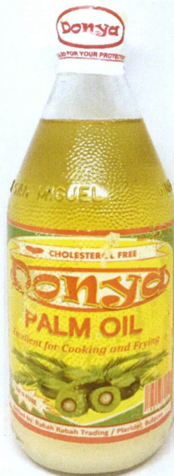
Figure 5. Unregistered DONYA Palm Oil

The FDA verified through post-marketing surveillance that the abovementioned food products are not authorized and the Certificates of Product Registration have not been issued. Pursuant to the Republic Act No. 9711, otherwise known as the “Food and Drug Administration Act of 2009”, the manufacture, importation, exportation, sale, offering for sale, distribution, transfer, non-consumer use, promotion, advertising or sponsorship of health products without the proper authorization is prohibited.