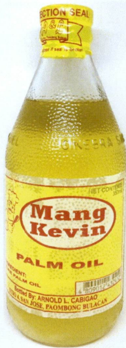
Figure 4. Unregistered MANG KEVIN Palm Oil