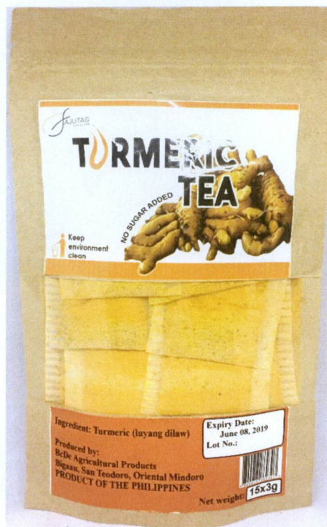
Figure 3. Unregistered SAJUTAG AGROFARM Turmeric Tea