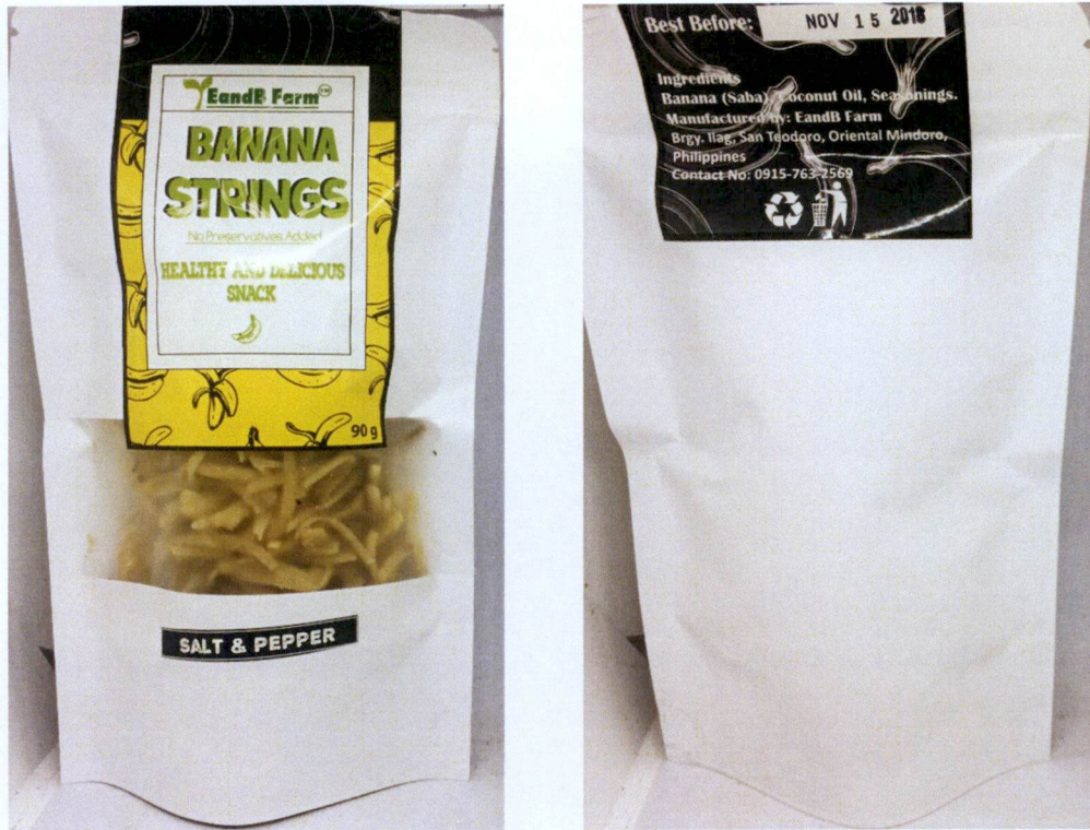
Figure 2. Unregistered EANDB FARM Banana Strings Salt & Pepper