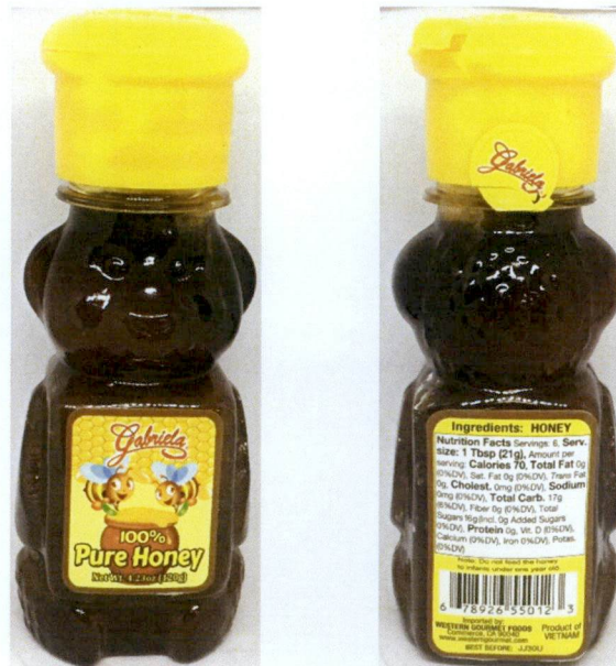
Figure 3. Unregistered GABRIELA 100% Pure Honey