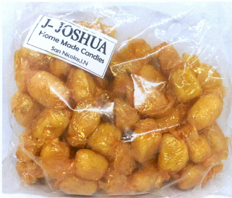
Figure 1. Unregistered J-JOSHUA Home Made Candies Pastillas

The Food and Drug Administration (FDA) warns the public from purchasing and consuming the following unregistered food products: