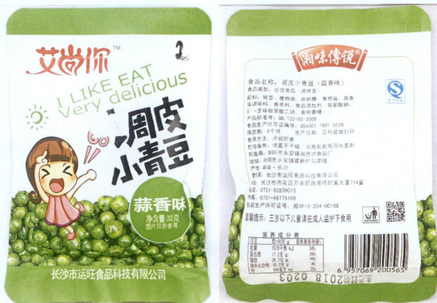
Figure 5. Unregistered I LIKE EAT VERY DELICIOUS Green Peas (In foreign characters)

The FDA verified through post-marketing surveillance that the abovementioned food products are not authorized and the Certificates of Product Registration have not been issued. Pursuant to the Republic Act No. 9711, otherwise known as the “Food and Drug Administration Act of 2009”, the manufacture, importation, exportation, sale, offering for sale, distribution, transfer, non-consumer use, promotion, advertising or sponsorship of health products without the proper authorization is prohibited.