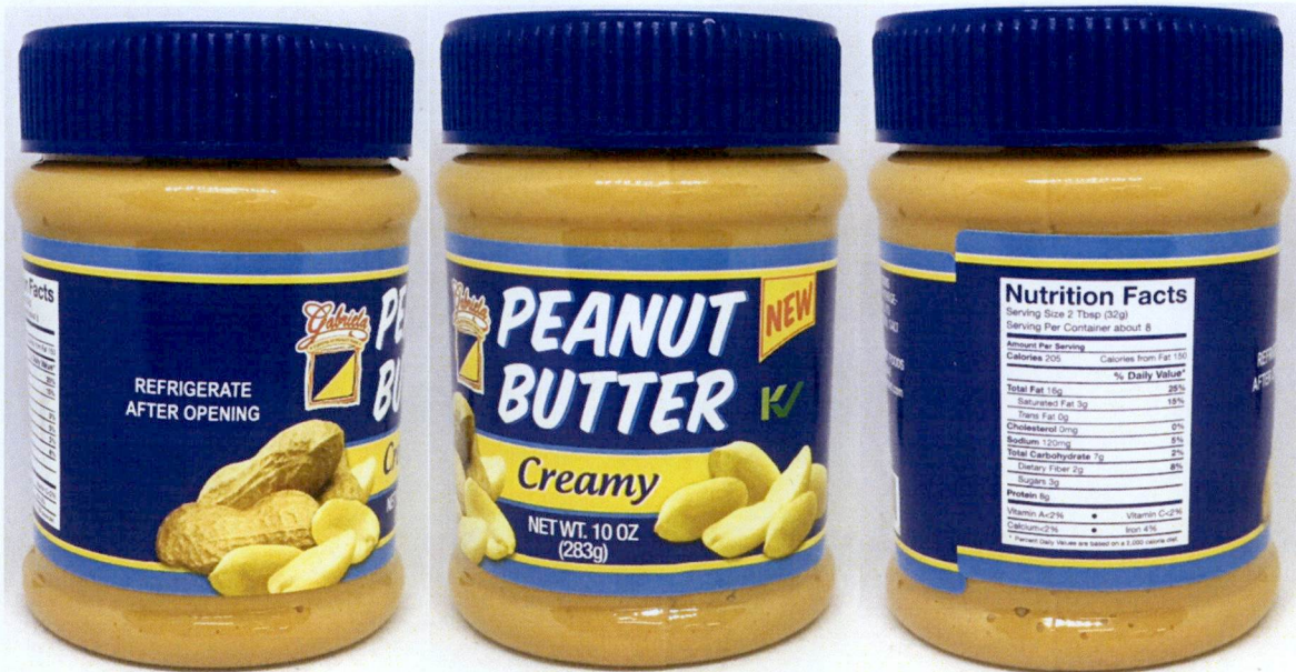
Figure 2. Unregistered GABRIELA Peanut Butter Creamy