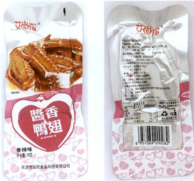
Figure 4. Unregistered AI SHANG NI Duck Wings (In foreign characters)