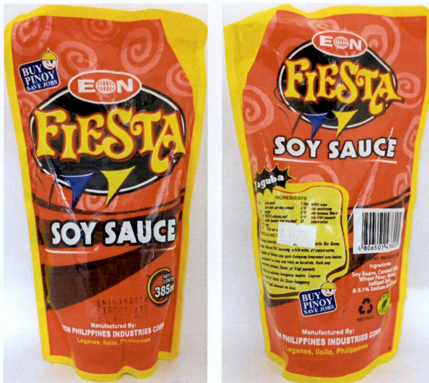
Figure 1. Unregistered EON FIESTA Soy Sauce, 385 ml

The Food and Drug Administration (FDA) warns the public from purchasing and consuming the following unregistered food products: