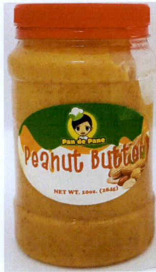
Figure 4. Unregistered PAN DE PANE Peanut Butter, 284g