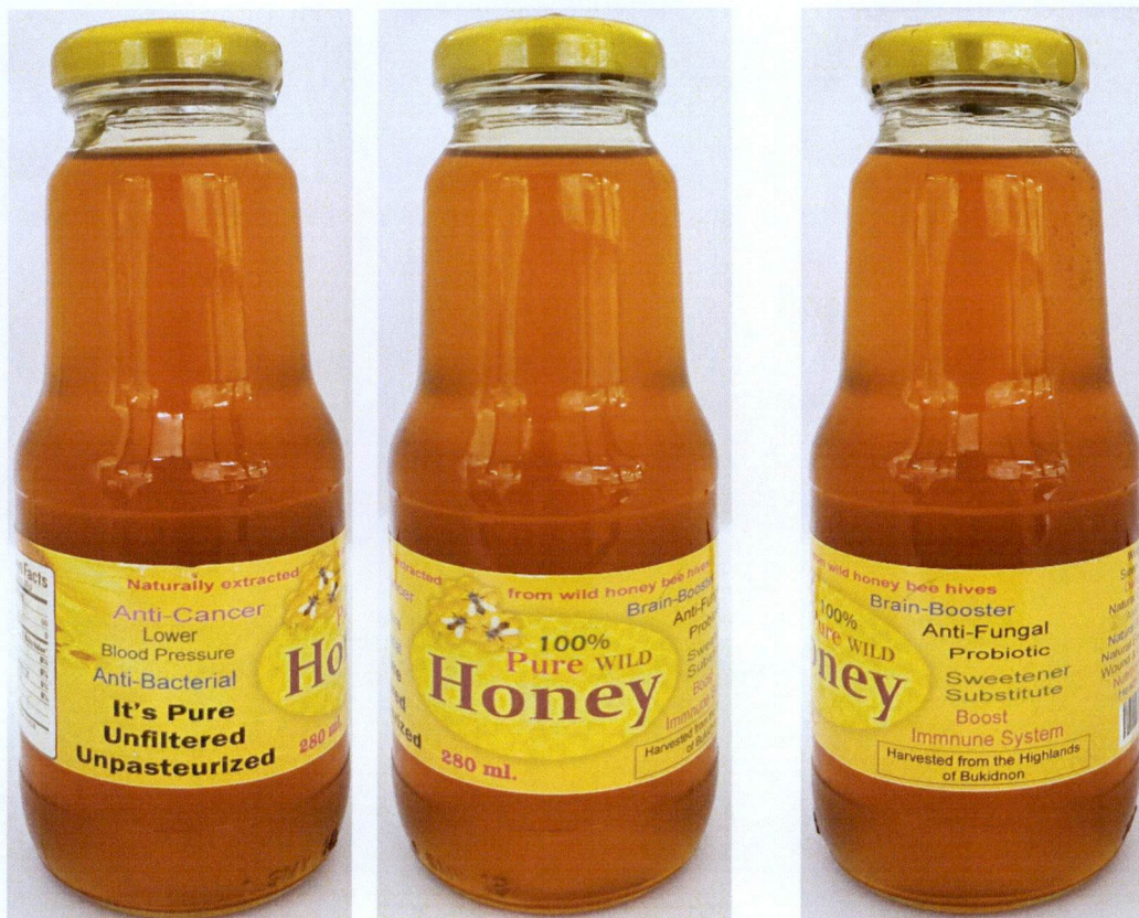
Figure 3. Unregistered 100% Pure Wild Honey