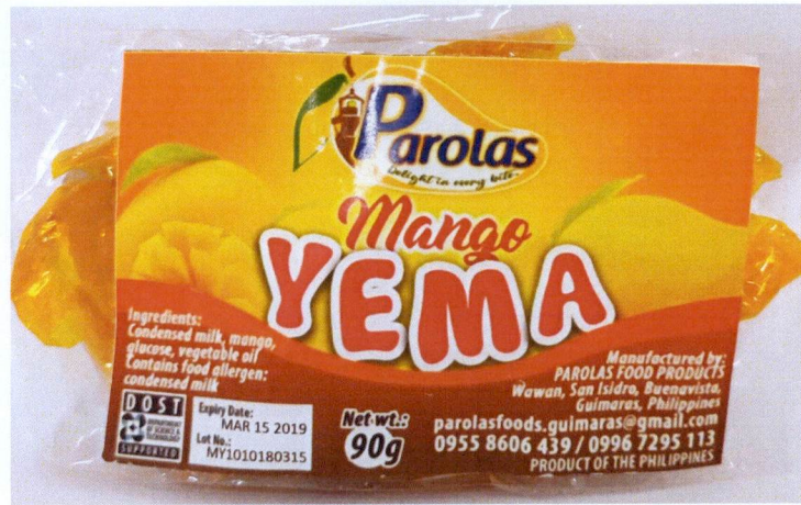
3Figure 2. Unregistered PAROLAS Mango Yema, 90 g