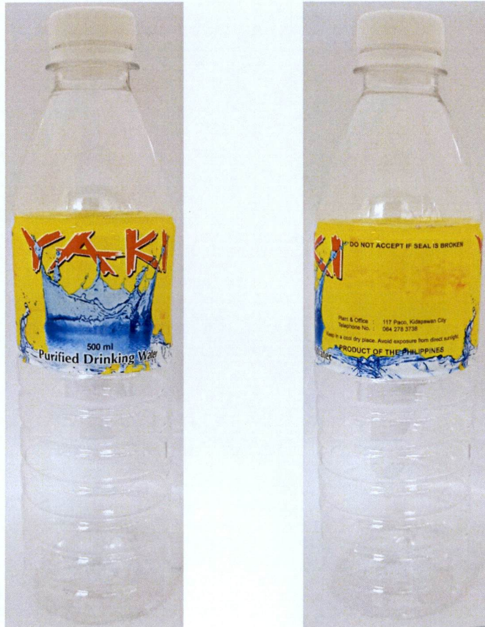
Figure 5. Unregistered YAKI Purified Drinking Water

The FDA verified through post-marketing surveillance that the abovementioned food products are not authorized and the Certificates of Product Registration have not been issued. Pursuant to the Republic Act No. 9711, otherwise known as the “Food and Drug Administration Act of 2009”, the manufacture, importation, exportation, sale, offering for sale, distribution, transfer, non-consumer use, promotion, advertising or sponsorship of health products without the proper authorization is prohibited.