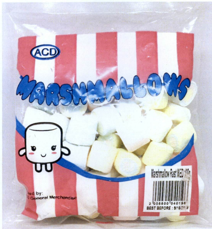
Figure 4. Unregistered ACD Marshmallows