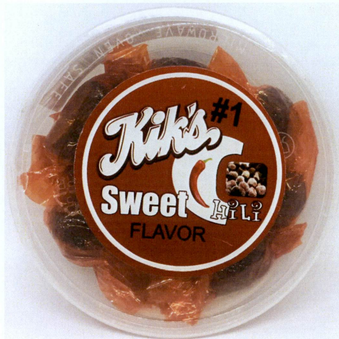
Figure 5. Unregistered KIK'S Sampaloc Sweet Chili Flavor

The FDA verified through post-marketing surveillance that the abovementioned food products and food supplements are not authorized and the Certificates of Product Registration have not been issued. Pursuant to the Republic Act No. 9711, otherwise known as the "Food and Drug Administration Act of 2009", the manufacture, importation, exportation, sale, offering for sale, distribution, transfer, non-consumer use, promotion, advertising or sponsorship of health products without the proper authorization is prohibited.