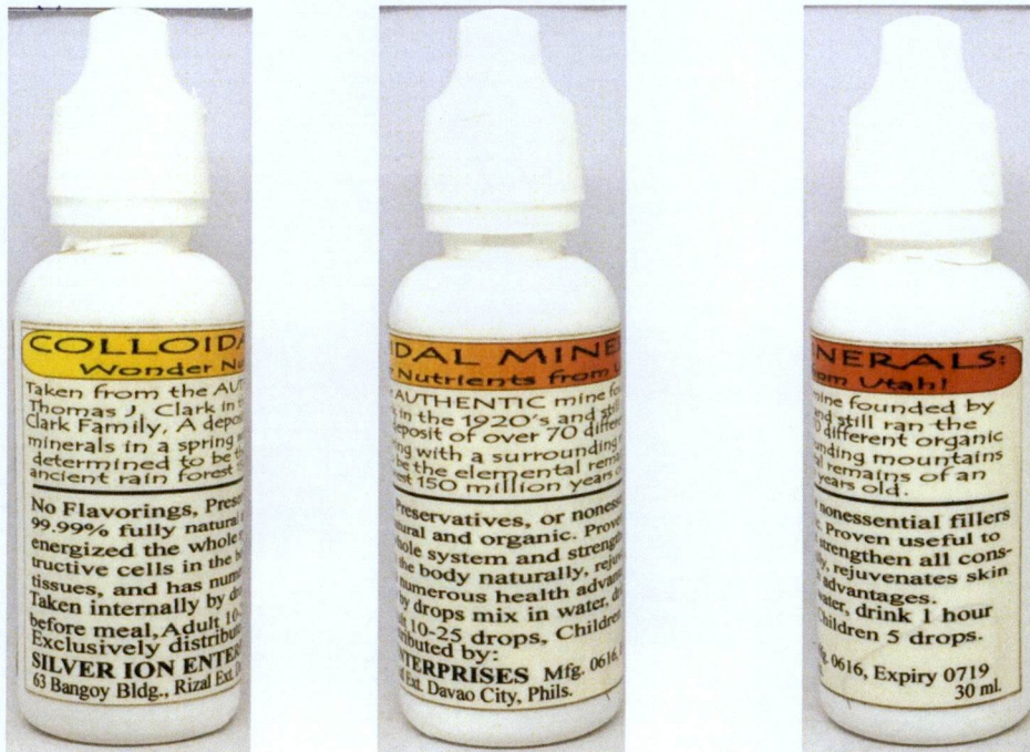
Figure 3. Unregistered Colloidal Minerals: Wonder Nutrients from Utah