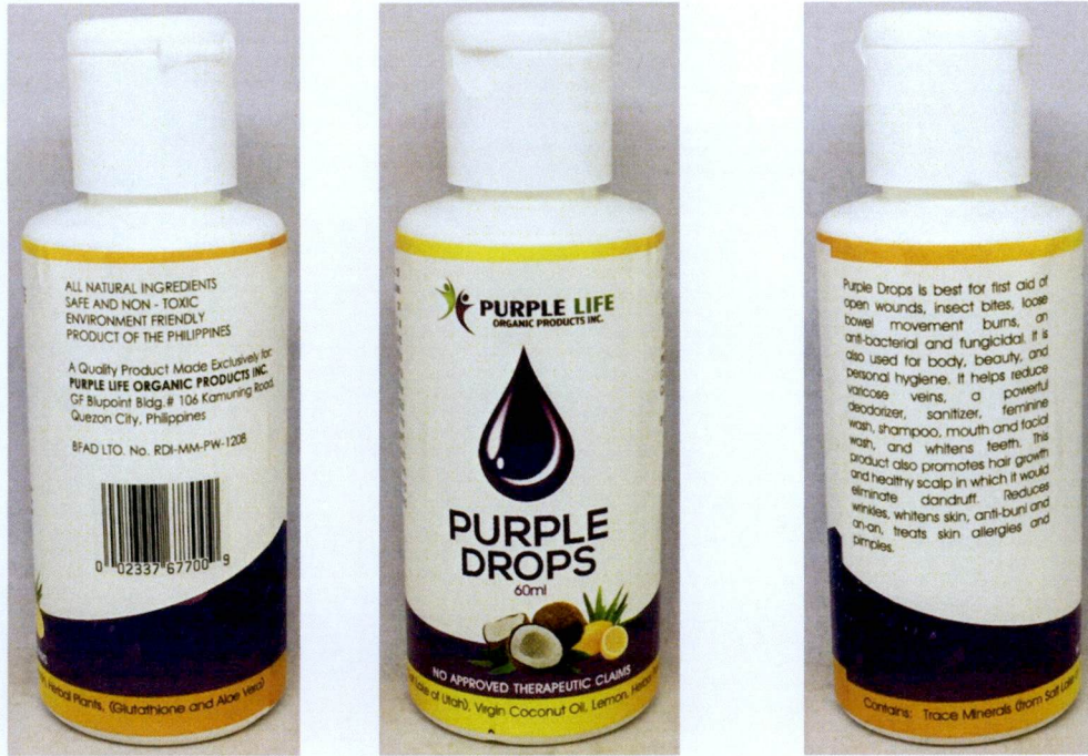
Figure 2. Unregistered PURPLE LIFE ORGANIC PRODUCTS INC. Purple Drops Food Supplement