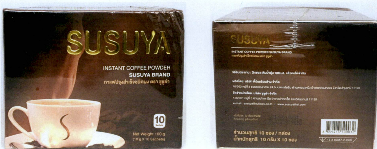
Figure 1. Unregistered SUSUYA Instant Coffee Powder

The Food and Drug Administration (FDA) warns the public from purchasing and consuming the following unregistered food products and food supplements: