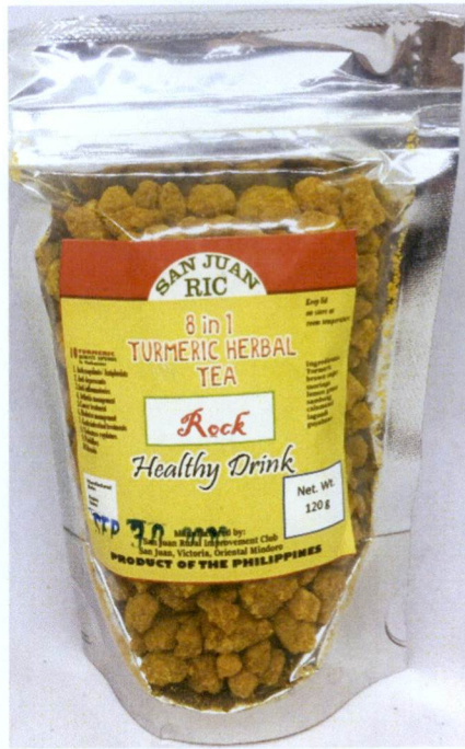
Figure 4. Unregistered SAN JUAN RIC 8 in 1 Instant Salabat Turmeric Herbal Tea Rock Healthy Drink