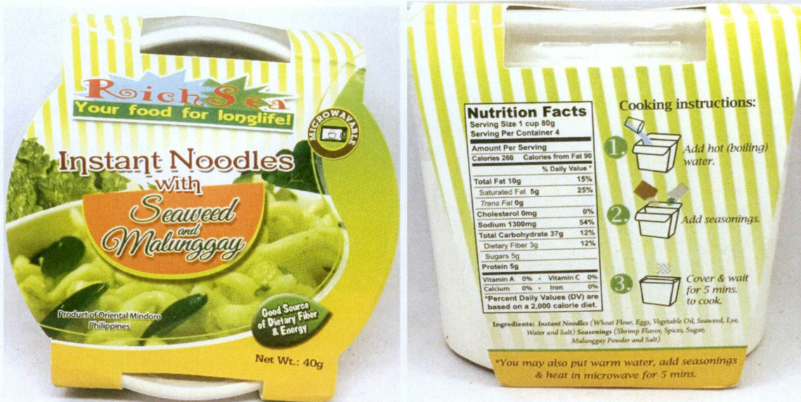
Figure 2. Unregistered RICHSEA Instant Noodles with Seaweed and Malunggay