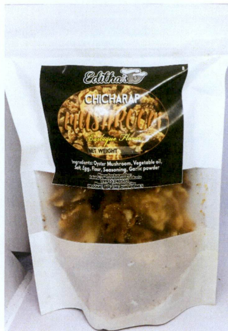
Figure 5. Unregistered EDITHA'S Chicharap Mushroom Barbeque Flavor

The FDA verified through post-marketing surveillance that the abovementioned food products are not authorized and the Certificates of Product Registration have not been issued. Pursuant to the Republic Act No. 9711, otherwise known as the “Food and Drug Administration Act of 2009”, the manufacture, importation, exportation, sale, offering for sale, distribution, transfer, non-consumer use, promotion, advertising or sponsorship of health products without the proper authorization is prohibited.