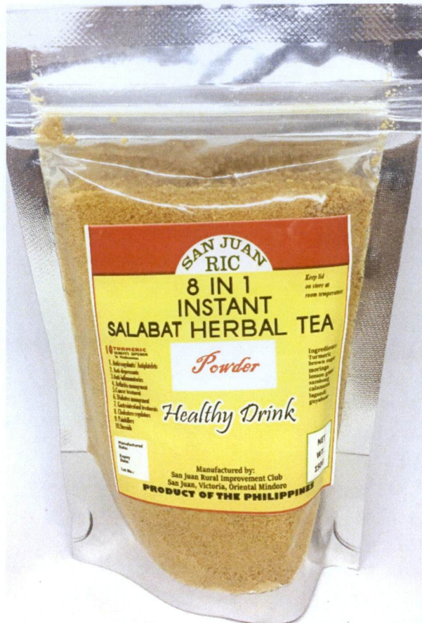
Figure 3. Unregistered SAN JUAN RIC 8 in 1 Instant Salabat Herbal Tea Powder Healthy Drink