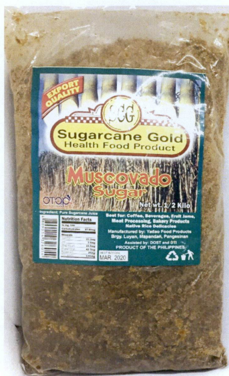
Figure 1. Unregistered SCG Sugarcane Gold Health Food Product Muscovado Sugar

The Food and Drug Administration (FDA) warns the public from purchasing and consuming the following unregistered food products: