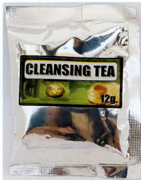
Figure 3. Unregistered HEALING GALING Cleansing Tea, 12 g