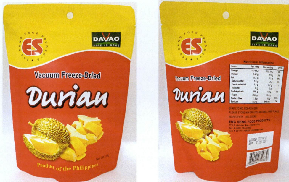
Figure 1. Unregistered ES Vacuum Freeze-Dried Durian, 20g

The Food and Drug Administration (FDA) warns the public from purchasing and consuming the following unregistered food products and food supplement: