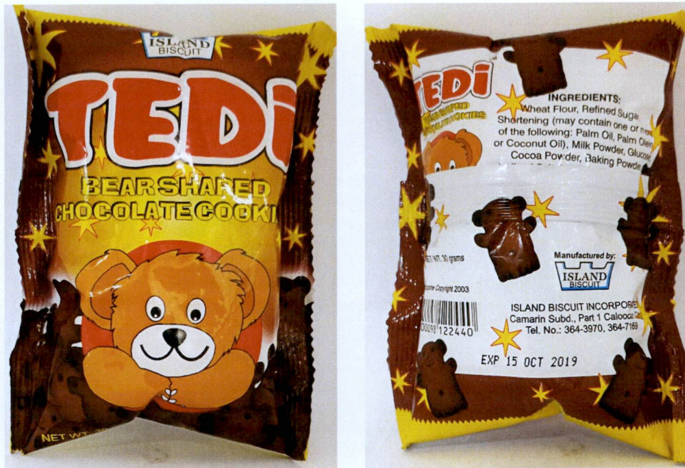
Figure 2. Unregistered ISLAND BISCUIT TEDI Bear-shaped Chocolate Cookies, 30 g