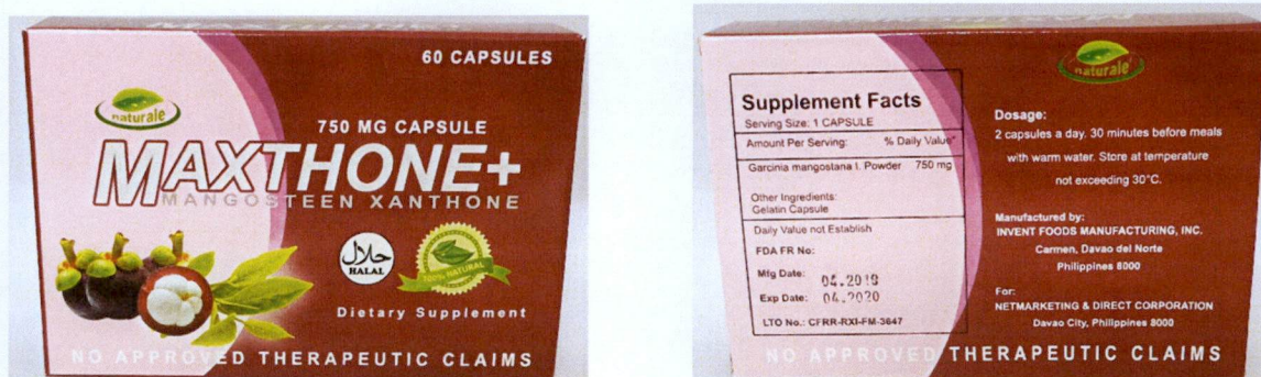
Figure 5. Unregistered MAXTHONE+ Mangosteen Xanthone 750 mg Dietary Supplement Capsule

The FDA verified through post-marketing surveillance that the abovementioned food products and food supplement are not authorized and the Certificates of Product Registration have not been issued. Pursuant to the Republic Act No. 9711, otherwise known as the “Food and Drug Administration Act of 2009”, the manufacture, importation, exportation, sale, offering for sale, distribution, transfer, non-consumer use, promotion, advertising or sponsorship of health products without the proper authorization is prohibited.