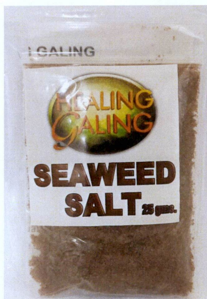
Figure 4. Unregistered HEALING GALING Seaweed Salt, 25 g