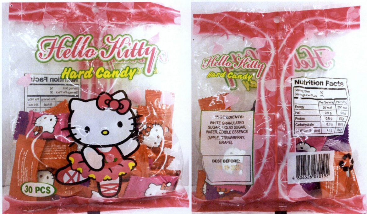
Figure 4. Unregistered HELLO KITTY Hard Candy