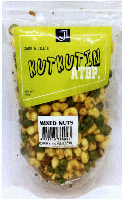
Figure 2. Unregistered JAKE & JILL'S Kutkutin Atbp.