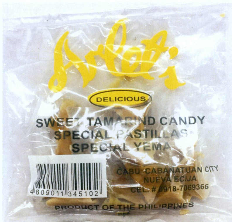
Figure 1. Unregistered ARLET'S Delicious Special Yema

The Food and Drug Administration (FDA) warns the public from purchasing and consuming the following unregistered food products: