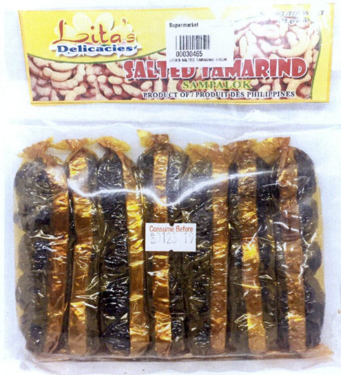
Figure 3. Unregistered LITA'S DELICACIES Salted Tamarind Sampalok