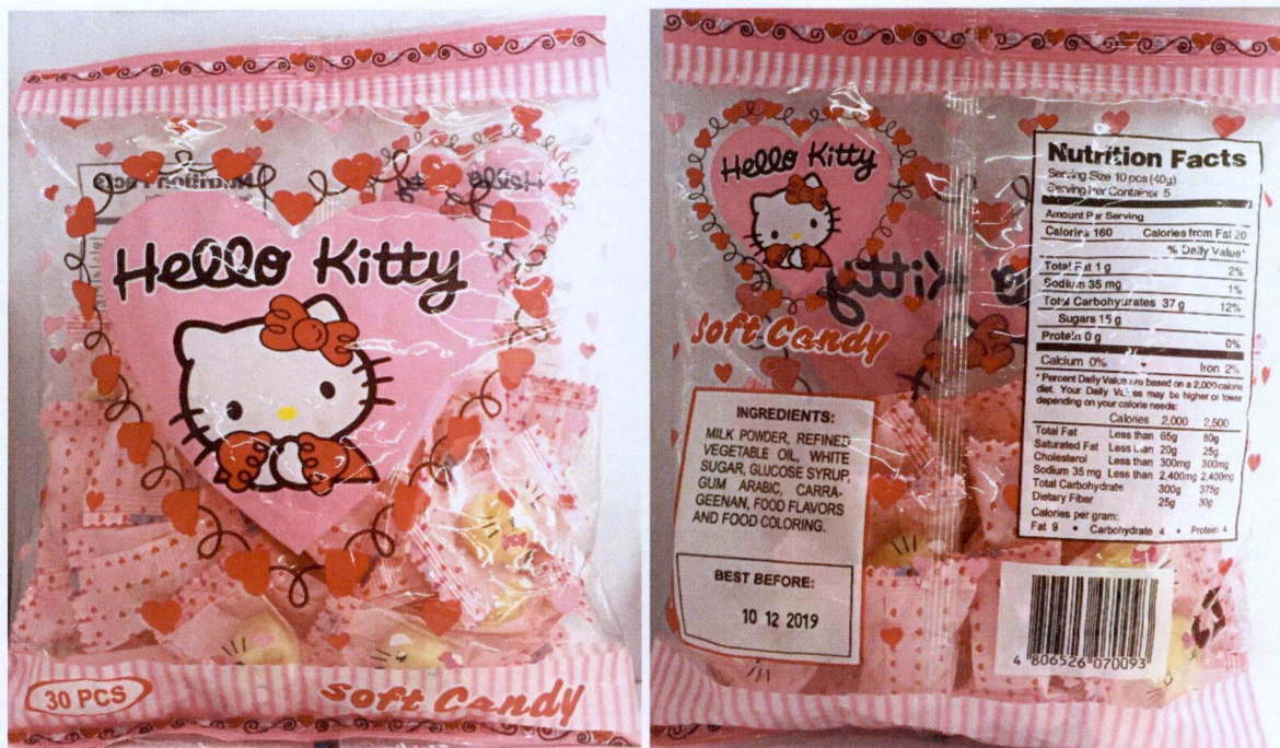
Figure 5. Unregistered HELLO KITTY Soft Candy

The FDA verified through post-marketing surveillance that the abovementioned food products are not authorized and the Certificates of Product Registration have not been issued. Pursuant to the Republic Act No. 9711, otherwise known as the “Food and Drug Administration Act of 2009”, the manufacture, importation, exportation, sale, offering for sale, distribution, transfer, non-consumer use, promotion, advertising or sponsorship of health products without the proper authorization is prohibited.