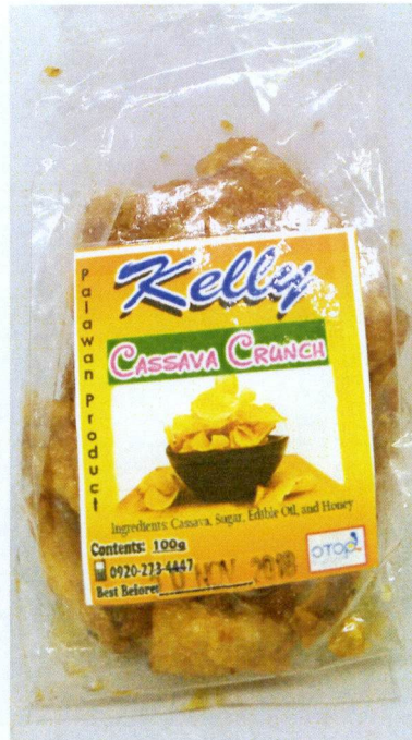
Figure 2. Unregistered KELLY Cassava Crunch