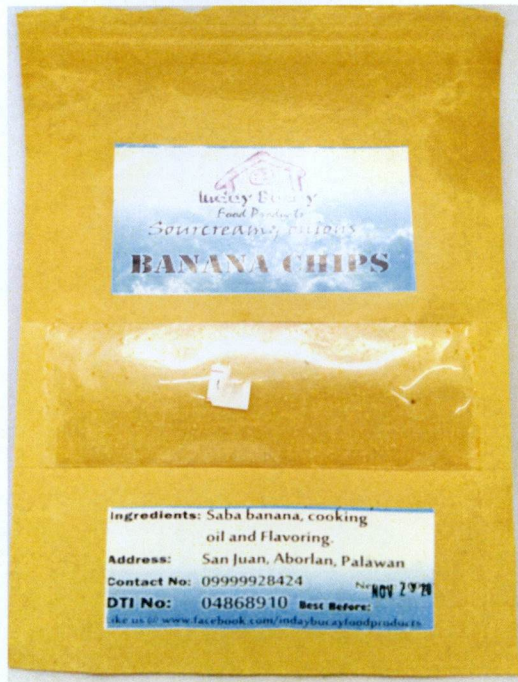
Figure 4. Unregistered INDAY BUCAY FOOD PRODUCTS Banana Chips Cheese