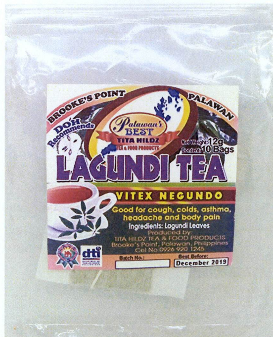
Figure 3. Unregistered PALAWAN'S BEST TITA HILDZ TEA & FOOD PRODUCTS Lagundi Tea Vitex negundo