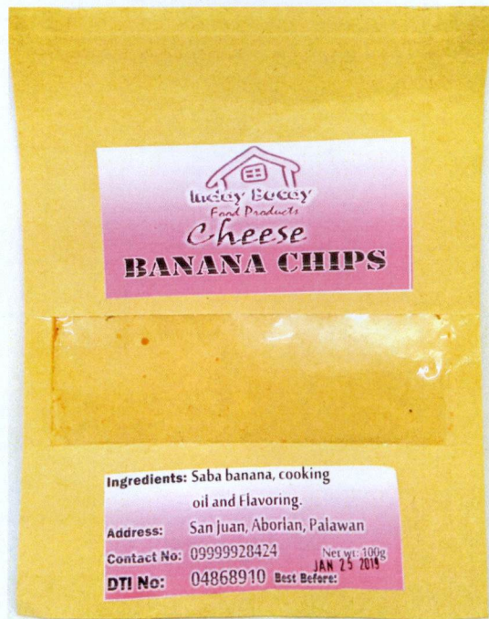
Figure 5. Unregistered INDAY BUCAY FOOD PRODUCTS Banana Chips Sourcream & Onion

The FDA verified through post-marketing surveillance that the abovementioned food products are not authorized and the Certificates of Product Registration have not been issued. Pursuant to the Republic Act No. 9711, otherwise known as the “Food and Drug Administration Act of 2009”, the manufacture, importation, exportation, sale, offering for sale, distribution, transfer, non-consumer use, promotion, advertising or sponsorship of health products without the proper authorization is prohibited.