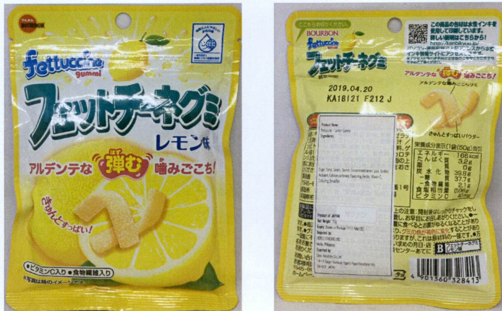
Figure 5. Unregistered BOURBON Fettuccine Gummi Lemon flavour

The FDA verified through post-marketing surveillance that the abovementioned food products are not authorized and the Certificates of Product Registration have not been issued. Pursuant to the Republic Act No. 9711, otherwise known as the “Food and Drug Administration Act of 2009”, the manufacture, importation, exportation, sale, offering for sale, distribution, transfer, non-consumer use, promotion, advertising or sponsorship of health products without the proper authorization is prohibited.