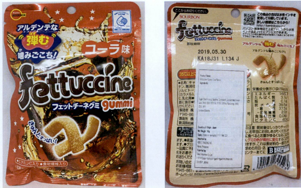
Figure 4. Unregistered BOURBON Fettuccine Gummi Grape Flavour