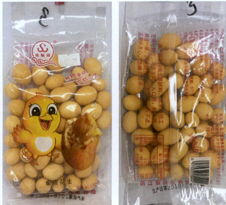
Figure 1. Unregistered Peanut Eggroll (In foreign characters)

The Food and Drug Administration (FDA) warns the public from purchasing and consuming the following unregistered food products: