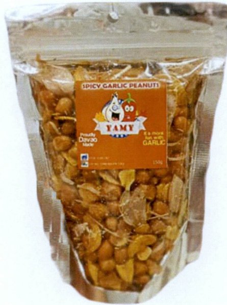
Figure 5. Unregistered YAMY Spicy Garlic Peanuts

The FDA verified through post-marketing surveillance that the abovementioned food products are not authorized and the Certificates of Product Registration (CPR) have not been issued. Pursuant to the Republic Act No. 9711, otherwise known as the “Food and Drug Administration Act of 2009”, the manufacture, importation, exportation, sale, offering for sale, distribution, transfer, non-consumer use, promotion, advertising or sponsorship of health products without the proper authorization is prohibited.