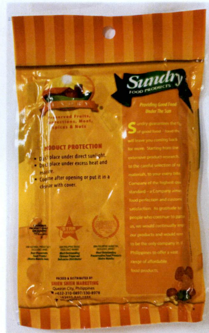
Figure 4. Unregistered SUNDRY FOOD PRODUCTS Roasted Peanuts