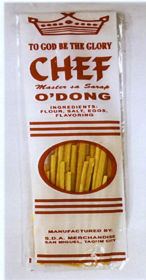
Figure 3. Unregistered CHEF O'DONG Noodle