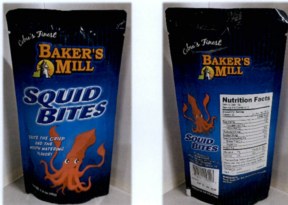
Figure 1. Unregistered BAKER'S MILL Squid Bites

The Food and Drug Administration (FDA) advises the public from purchasing and consuming the following unregistered food products: