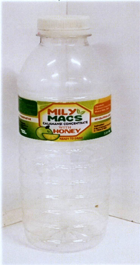
Figure 2. Unregistered MILY MACS Calamansi Concentrate with Honey