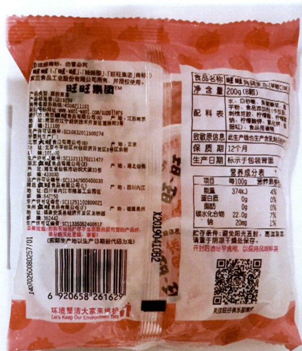
Figure 2. Unregistered Strawberry Flavored Jelly in a Cup (In Foreign Language)