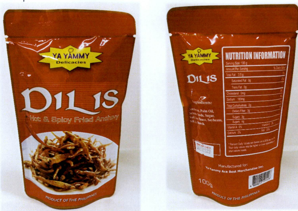
Figure 4. Unregistered YA YAMMY DELICACIES Dilis Hot & Spicy Fried Anchovy