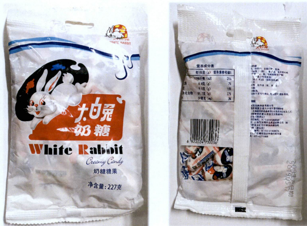
Figure 1. Unregistered WHITE RABBIT Creamy Candy (In Foreign Language)

The Food and Drug Administration (FDA) advises the public from purchasing and consuming the following unregistered food products: