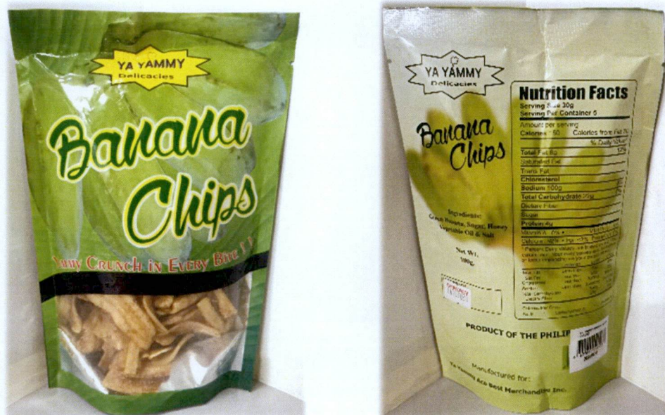
Figure 5. Unregistered YA YAMMY DELICACIES Banana Chips

The FDA verified through post-marketing surveillance that the abovementioned food products are not authorized and the Certificates of Product Registration (CPR) have not been issued. Pursuant to the Republic Act No. 9711, otherwise known as the “Food and Drug Administration Act of 2009”, the manufacture, importation, exportation, sale, offering for sale, distribution,