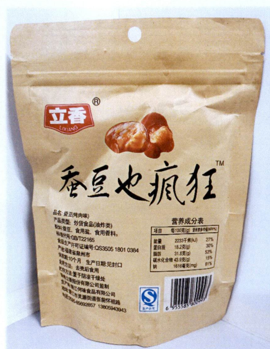
Figure 3. Unregistered LIXIANG Salted Chestnuts (In Foreign Language)