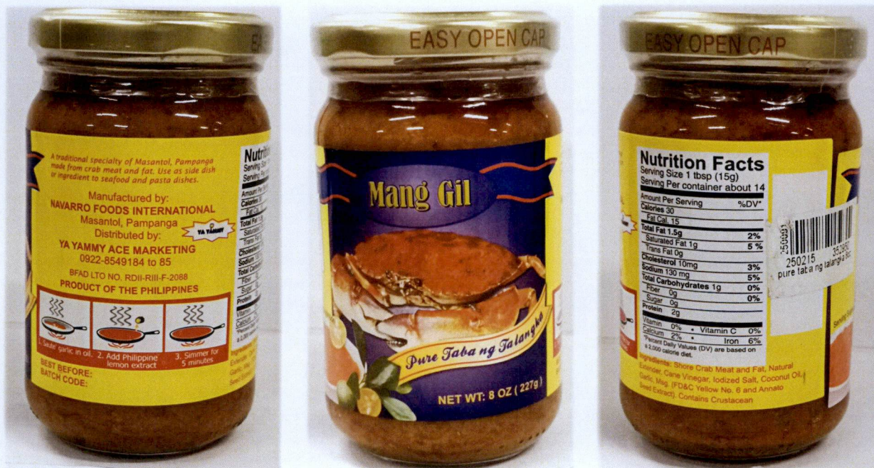
Figure 1. Unregistered MANG GIL Pure Taba ng Talangka

The Food and Drug Administration (FDA) advises the public from purchasing and consuming the following unregistered food products: