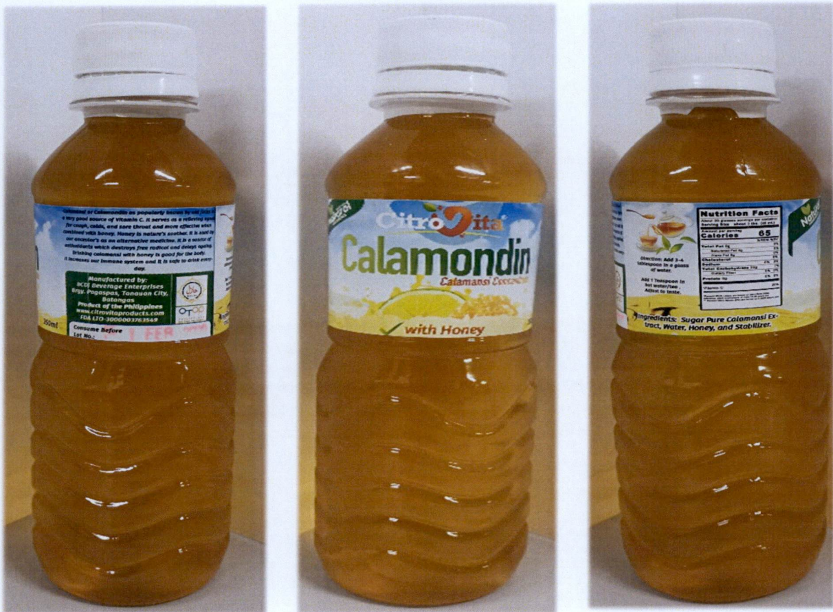
Figure 3. Unregistered CITRO VITA Calamondin Calamansi Concentrate with Honey