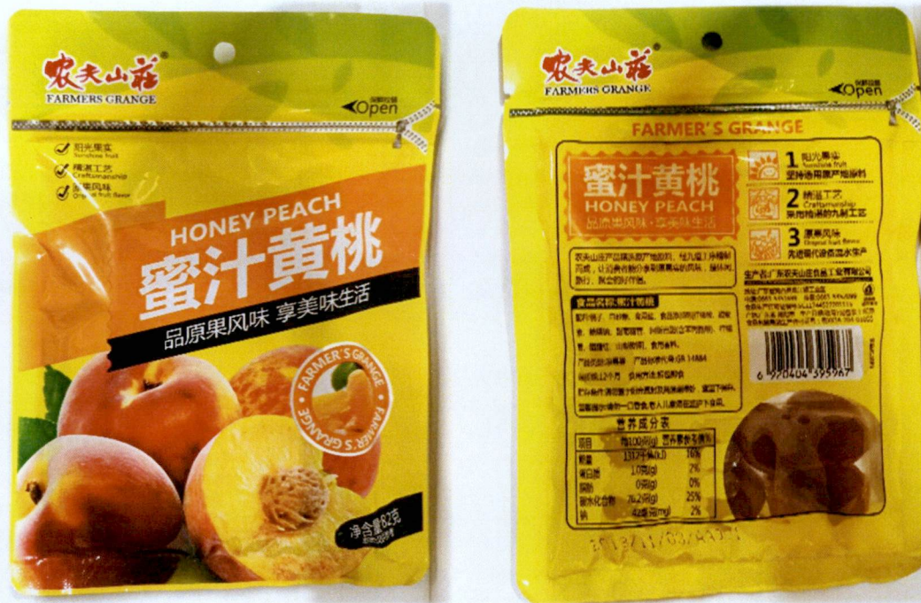
Figure 4. Unregistered FARMERS GRANGE Honey Peach (In Foreign Language)