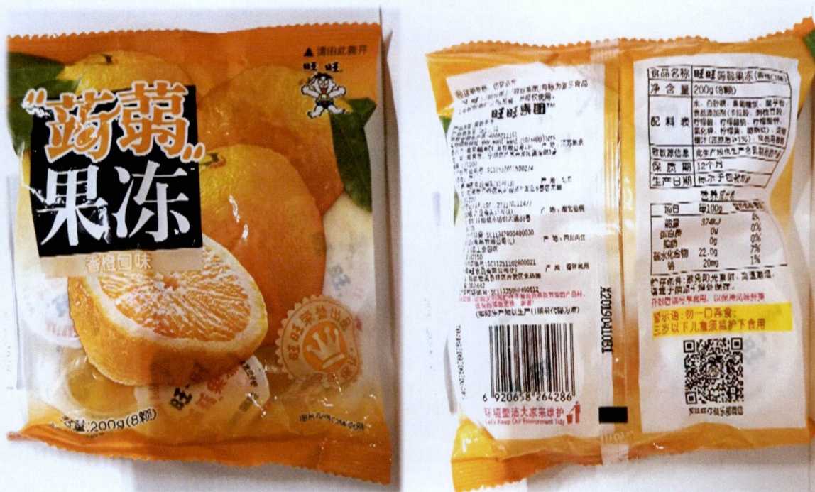
Figure 5. Unregistered Orange Flavored Jelly in a Cup (In Foreign Language)

The FDA verified through post-marketing surveillance that the abovementioned food products are not authorized and the Certificates of Product Registration (CPR) have not been issued. Pursuant to the Republic Act No. 9711, otherwise known as the “Food and Drug Administration Act of 2009”, the manufacture, importation, exportation, sale, offering for sale, distribution,