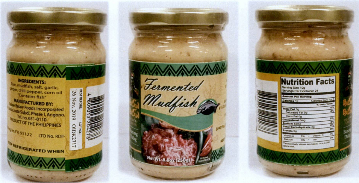
Figure 2. Unregistered BALAW BALAW THE ART OF FLAVORS Burong Hito (Fermented Catfish)