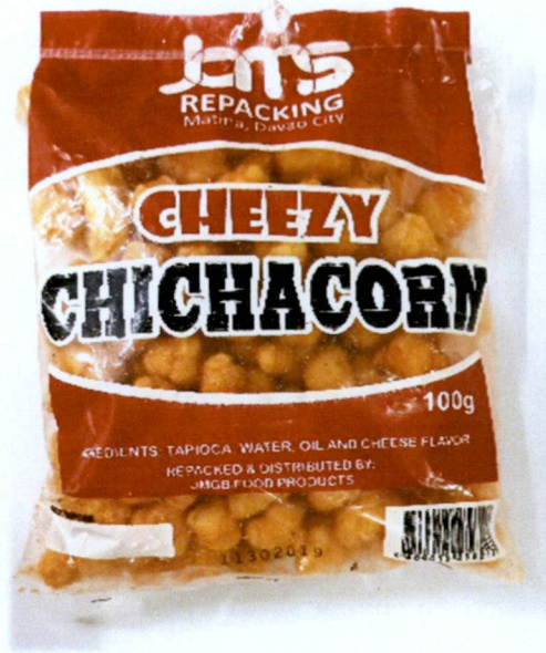
Figure 2. Unregistered JAMS REPACKING Cheezy Chicharon