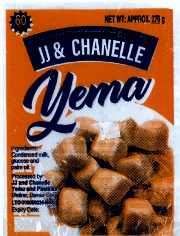
Figure 1. Unregistered JJ & CHANELLE Yema

The Food and Drug Administration (FDA) advises the public from purchasing and consuming the following unregistered food products: