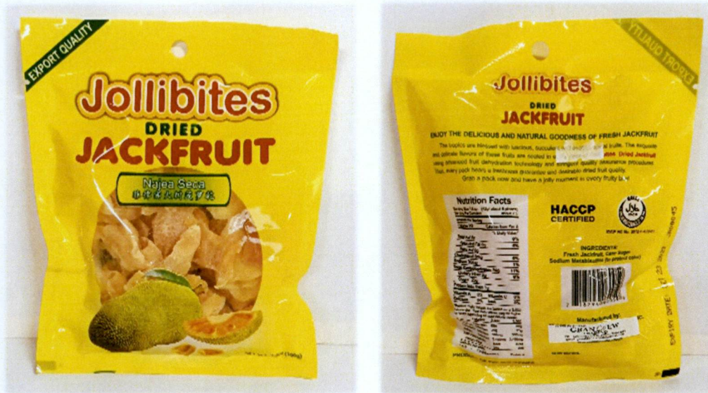
Figure 5. Unregistered JOLLIBITES Dried JackFruit

The FDA verified through post-marketing surveillance that the abovementioned food products are not authorized and the Certificates of Product Registration (CPR) have not been issued. Pursuant to the Republic Act No. 9711, otherwise known as the “Food and Drug Administration Act of 2009”, the manufacture, importation, exportation, sale, offering for sale, distribution, transfer, non-consumer use, promotion, advertising or sponsorship of health products without the proper authorization is prohibited.