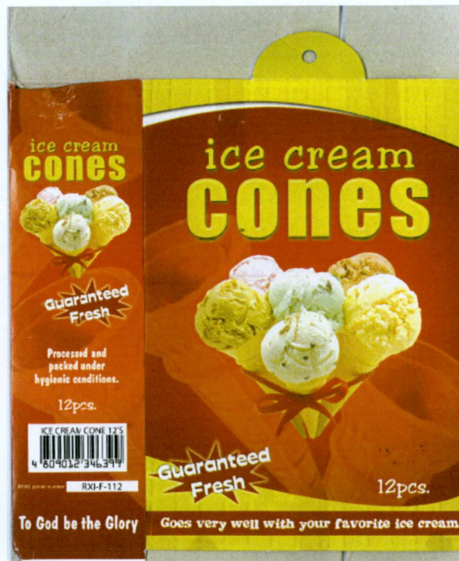
Figure 3. Unregistered Ice Cream Cones