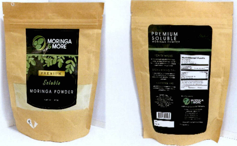
Figure 4. Unregistered MORINGA & MORE PREMIUM Soluble Moringa Powder