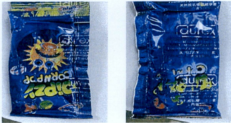
Photo of the silver foil pack of the DIPZY CORNPOP Lollipops