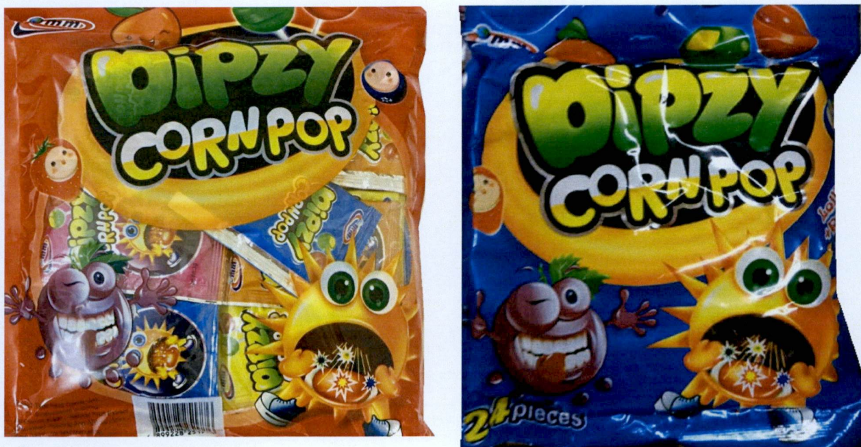
Figure 1. Unregistered DIPZY CORNPOP Lollipops

The Food and Drug Administration (FDA) warns the public from purchasing and consuming the following unregistered DIPZY CORNPOP Lollipops under the company MM LUCKY MULTISALES CORPORATION with unauthorized use of DUREX condom foil packaging as lollipop wrapper: