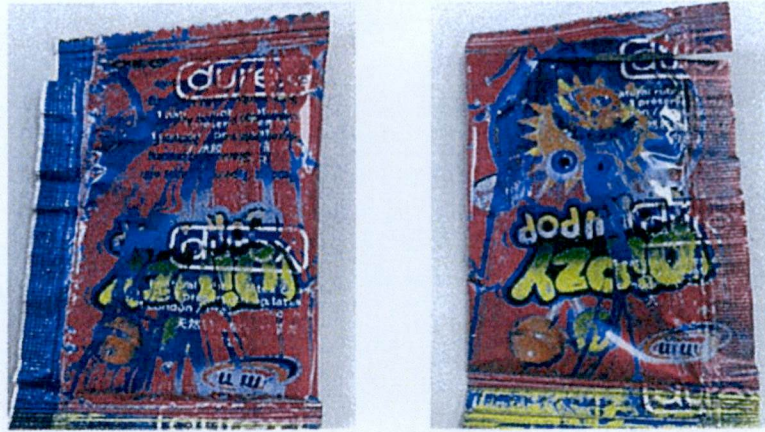
Photo of the blue foil pack of DIPZY CORNPOP Lollipops