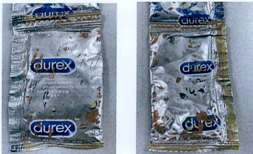
Figure 2. Unregistered DIPZY CORNPOP Lollipops using DUREX Condom Foil Packaging as Lollipop Wrapper