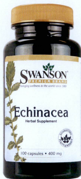
Figure 5. Unregistered SWANSON Echinacea Herbal Supplement

The FDA verified through post-marketing surveillance that the abovementioned food products and food supplements are not authorized and the Certificates of Product Registration have not been issued. Pursuant to the Republic Act No. 9711, otherwise known as the “Food and Drug Administration Act of 2009”, the manufacture, importation, exportation, sale, offering for sale, distribution, transfer, non-consumer use, promotion, advertising or sponsorship of health products without the proper authorization is prohibited.