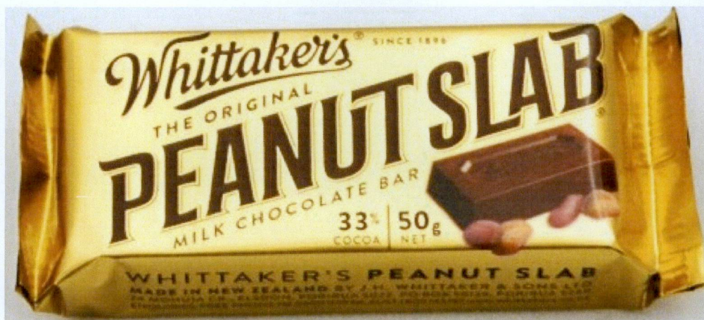
Figure 1. Unregistered WHITTAKER'S The Original Peanut Slab Milk Chocolate Bar

The Food and Drug Administration (FDA) warns the public from purchasing and consuming the following unregistered food products and food supplements: