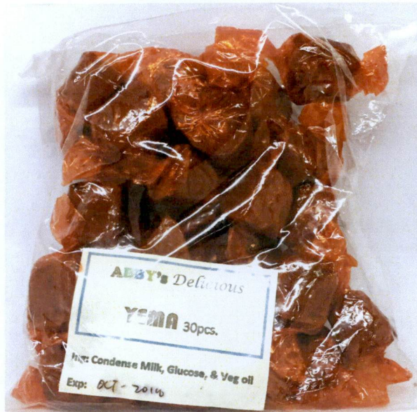
Figure 2. Unregistered ABBY'S DELICIOUS Yema