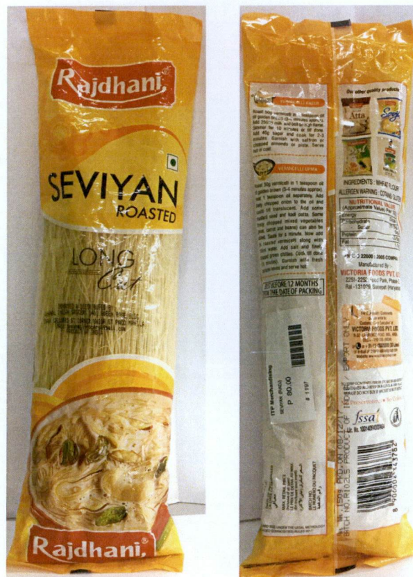
Figure 3. Unregistered RAJDHANI Seviyan Roasted Long Cut