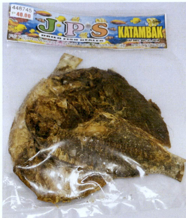
Figure 5. Unregistered JPS DRIED FISH DEALER Katambak

The FDA verified through post-marketing surveillance that the abovementioned food products are not authorized and the Certificates of Product Registration have not been issued. Pursuant to the Republic Act No. 9711, otherwise known as the “Food and Drug Administration Act of 2009”, the manufacture, importation, exportation, sale, offering for sale, distribution, transfer, non-consumer use, promotion, advertising or sponsorship of health products without the proper authorization is prohibited.