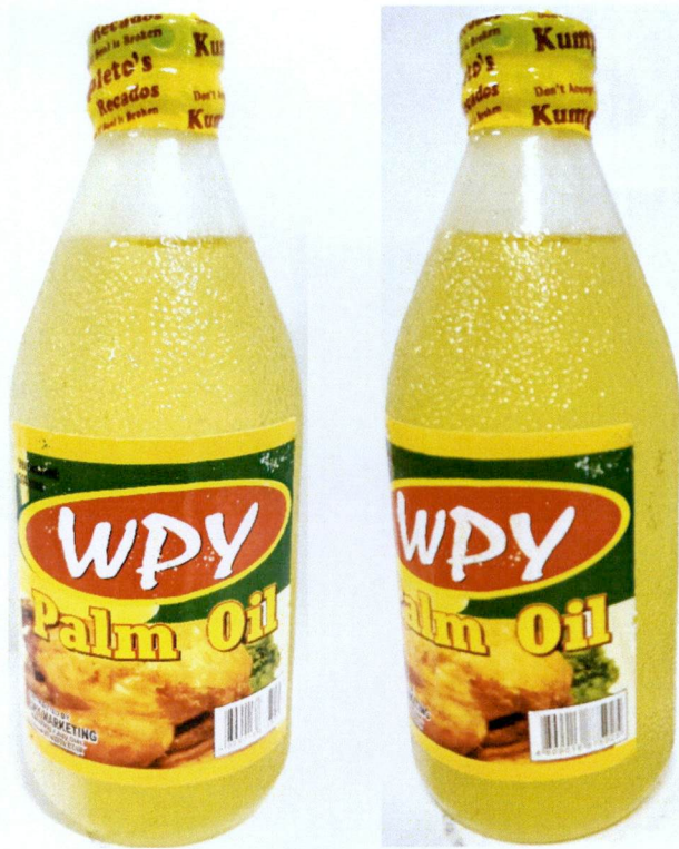
Figure 2. Unregistered WPDY Palm Oil