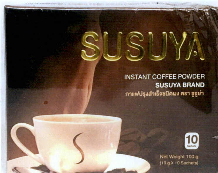
Figure 1. Unregistered SUSUYA Instant Coffee Powder

The Food and Drug Administration (FDA) warns the public from purchasing and consuming the following unregistered food products: