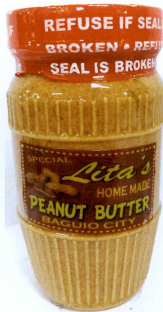
Figure 4. Unregistered LITA'S HOMEMADE Special Peanut Butter