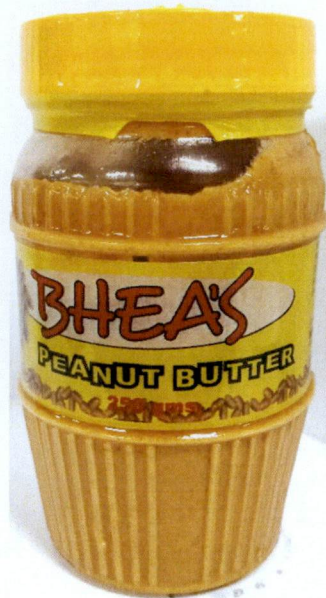
Figure 3. Unregistered BHEA'S Peanut Butter