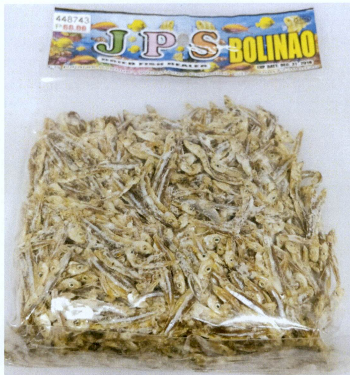
Figure 1. Unregistered JPS FISH DEALER Bolinao

The Food and Drug Administration (FDA) warns the public from purchasing and consuming the following unregistered food products: