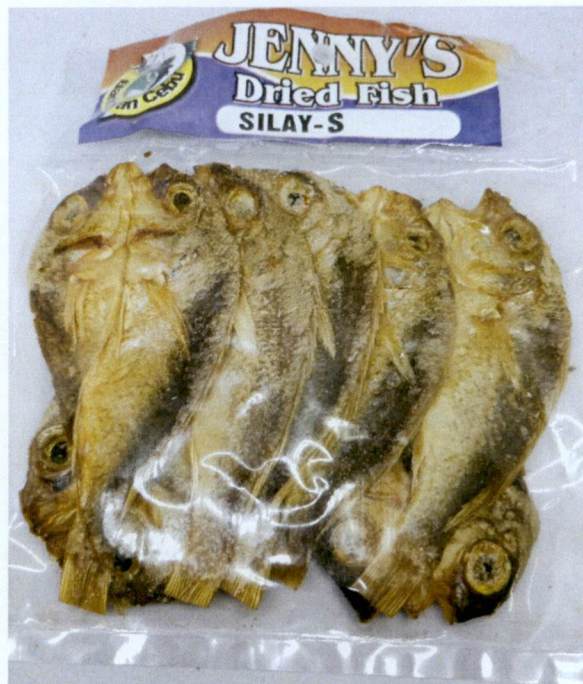
Figure 5. Unregistered JENNY'S DRIED FISH Silay-S

The FDA verified through post-marketing surveillance that the abovementioned food products are not authorized and the Certificates of Product Registration have not been issued. Pursuant to the Republic Act No. 9711, otherwise known as the "Food and Drug Administration Act of 2009", the manufacture, importation, exportation, sale, offering for sale, distribution, transfer, non-consumer use, promotion, advertising or sponsorship of health products without the proper authorization is prohibited.