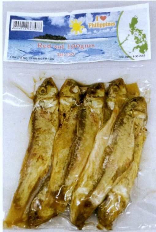
Figure 2. Unregistered SSE-CDO Red Sal