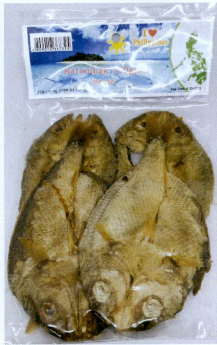
Figure 4. Unregistered SSE-CDO Katambak