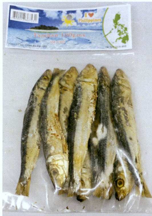
Figure 3. Unregistered SSE-CDO Tamban