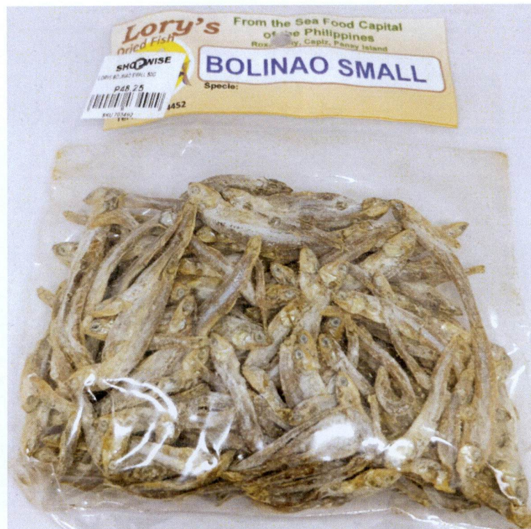
Figure 2. Unregistered LORY'S DRIED FISH Bolinao Small