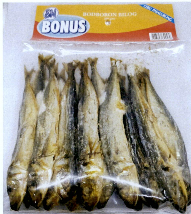
Figure 4. Unregistered SM BONUS Bodboron Bilog