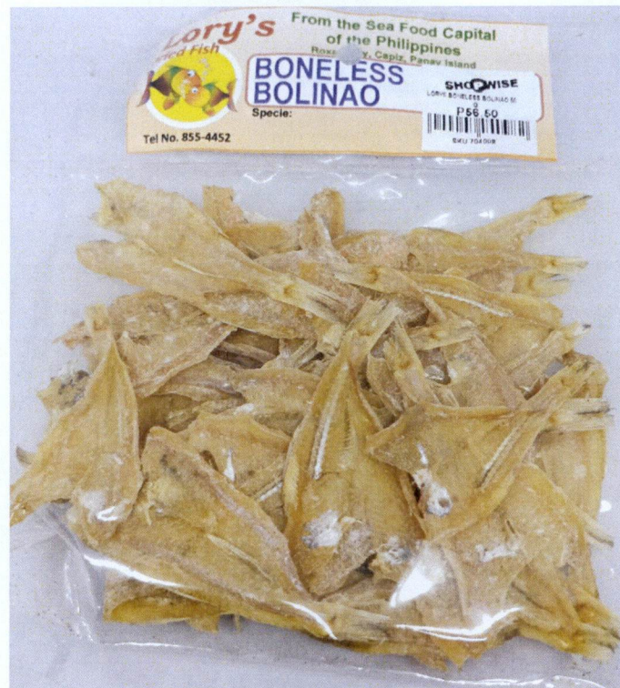
Figure 3. Unregistered LORY'S DRIED FISH Boneless Bolinao