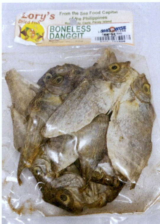
Figure 1. Unregistered LORY'S DRIED FISH Boneless Danggit

The Food and Drug Administration (FDA) warns the public from purchasing and consuming the following unregistered food products: