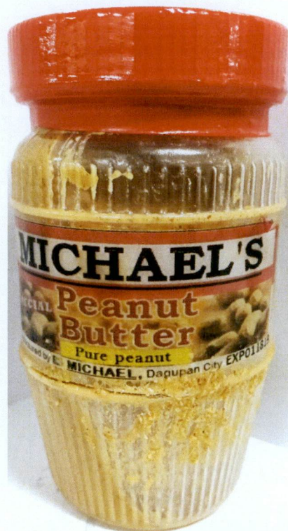
Figure 5. Unregistered MICHAEL'S Special Peanut Butter

The FDA verified through post-marketing surveillance that the abovementioned food products are not authorized and the Certificates of Product Registration have not been issued. Pursuant to the Republic Act No. 9711, otherwise known as the “Food and Drug Administration Act of 2009”, the manufacture, importation, exportation, sale, offering for sale, distribution, transfer, non-consumer use, promotion, advertising or sponsorship of health products without the proper authorization is prohibited.