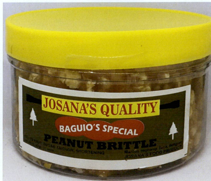
Figure 5. Unregistered JOSANA'S QUALITY BAGUIO'S SPECIAL Peanut Brittle

The FDA verified through post-marketing surveillance that the abovementioned food products and food supplements are not authorized and the Certificates of Product Registration have not been issued. Pursuant to the Republic Act No. 9711, otherwise known as the “Food and Drug Administration Act of 2009”, the manufacture, importation, exportation, sale, offering for sale, distribution, transfer, non-consumer use, promotion, advertising or sponsorship of health products without the proper authorization is prohibited.