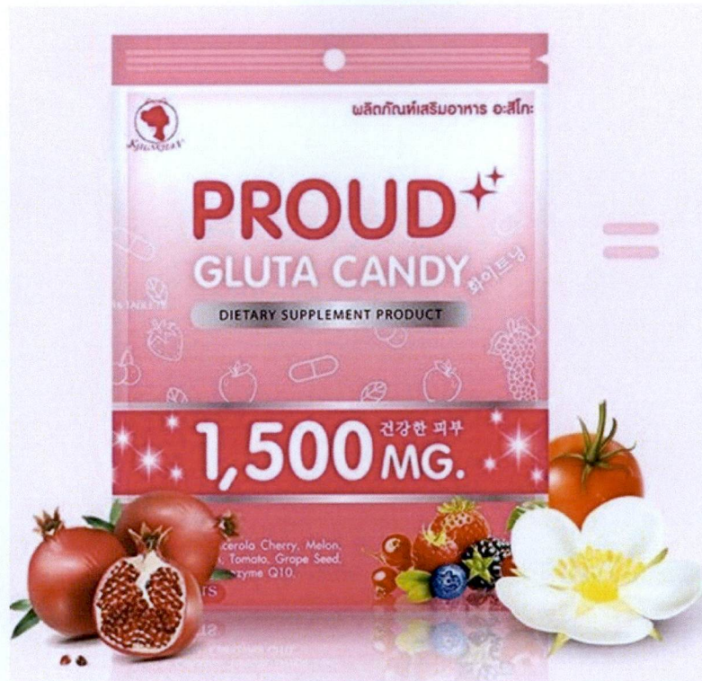
Figure 4. Unregistered PROUD Gluta Candy Dietary Supplement 1500 mg