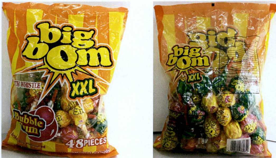
Figure 1. Unregistered BIG BOM XXL Lollipop with Bubble Gum with Whistle

The Food and Drug Administration (FDA) warns the public from purchasing and consuming the following unregistered food products and food supplements: