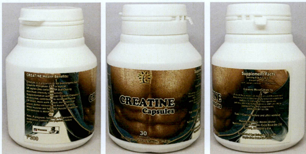
Figure 3. Unregistered Creatine Food Supplement Capsules