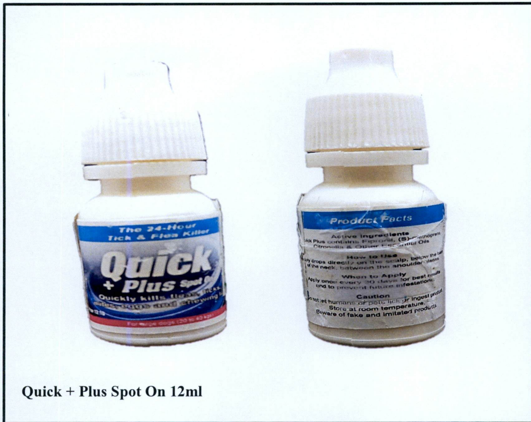
Quick + Plus Spot On 12ml