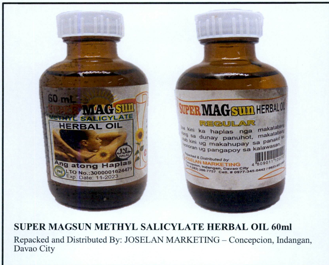
Figure 1. Unregistered drug product

The Food and Drug Administration (FDA) advises the public against the purchase and use of the unregistered drug products: