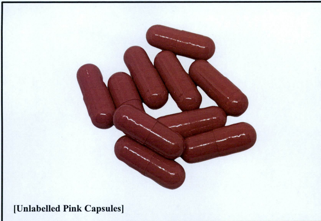
Figure 6. Unregistered drug product

FDA Post-Marketing Surveillance (PMS) activities have verified that the abovementioned drug products have not gone through the registration and testing process of the Agency and have not been issued with proper authorization in the form of Certificate of Product Registration. Thus, the Agency cannot guarantee their quality and safety. The consumption of such violative products may pose potential danger or injury if administered.