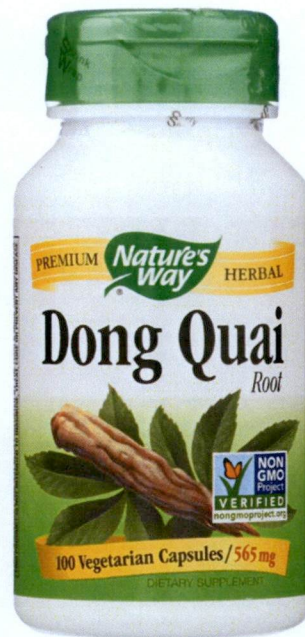
Figure 3. Unregistered NATURE'S WAY Dong Quai Root Dietary Supplement