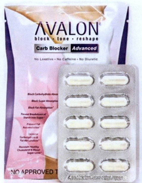
Figure 5. Unregistered AVALON Carb Blocker Advance Dietary Supplement

The FDA verified through post-marketing surveillance that the abovementioned food supplements are not registered and the Certificate of Product Registration (CPR) have not yet been issued. Pursuant to the Republic Act No. 9711, otherwise known as the “Food and Drug Administration Act of 2009”, the manufacture, importation, exportation, sale, offering for sale, distribution, transfer, non-consumer use, promotion, advertising or sponsorship of health products without the proper authorization is prohibited.