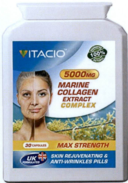
Figure 2. Unregistered VITACIO Marine Collagen Extract Complex Max Strength Skin Rejuvenating & Anti-Wrinkles