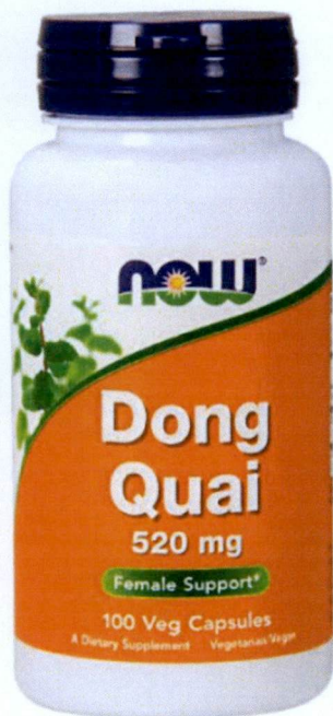
Figure 4. Unregistered NOW® Dong Quai Female Support Dietary Supplement