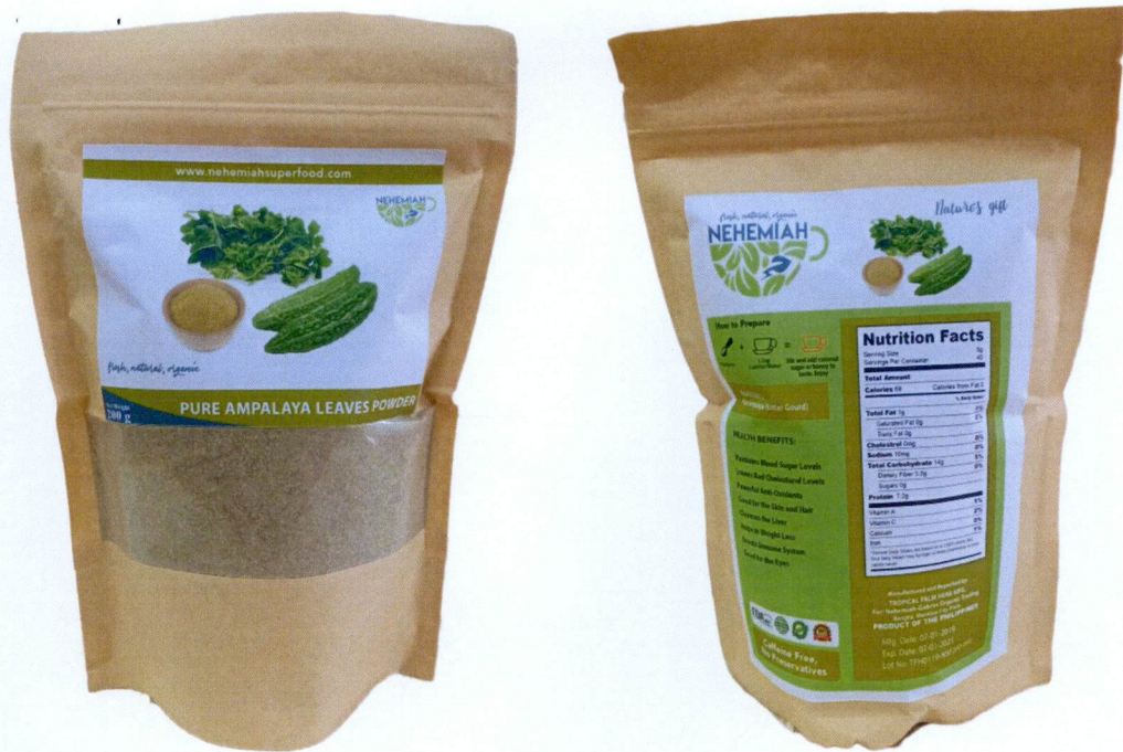
Figure 2. Unregistered NEHEMIAH Pure Ampalaya Leaves Powder