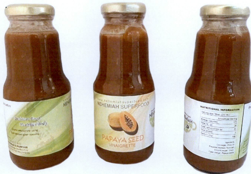
Figure 4. Unregistered NEHEMIAH SUPERFOOD Papaya Seed Vinaigrette