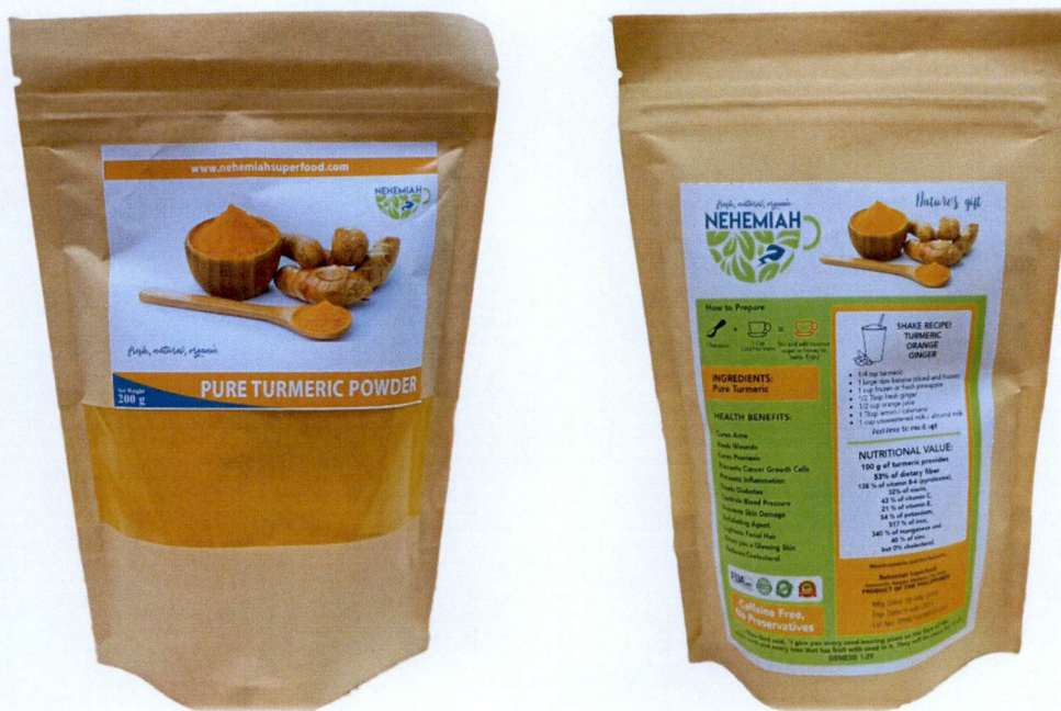
Figure 5. Unregistered NEHEMIAH Pure Turmeric Powder

The FDA verified through post-marketing surveillance that the abovementioned food products are not authorized and the Certificates of Product Registration (CPR) have not been issued. Pursuant to the Republic Act No. 9711, otherwise known as the “Food and Drug Administration Act of 2009”, the manufacture, importation, exportation, sale, offering for sale, distribution, transfer, non-consumer use, promotion, advertising or sponsorship of health products without the proper authorization is prohibited.