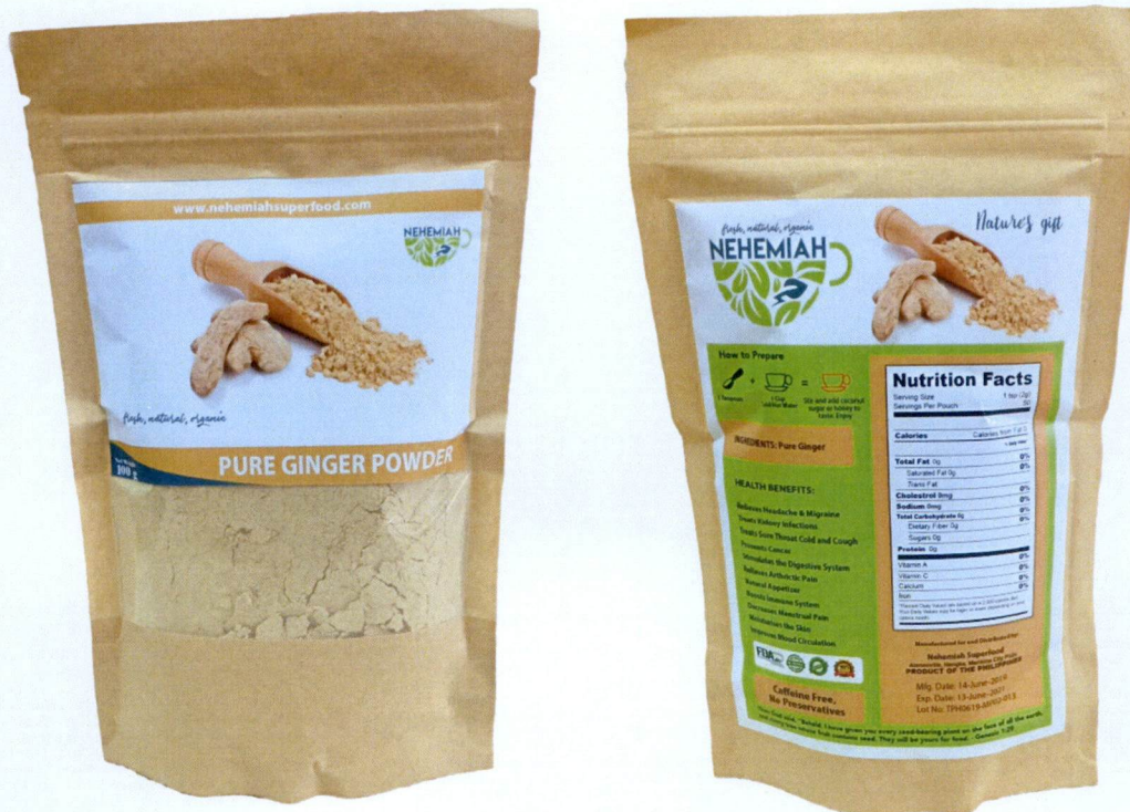
Figure 1. Unregistered NEHEMIAH Pure Ginger Powder

The Food and Drug Administration (FDA) advises the public from purchasing and consuming the following unregistered food products: