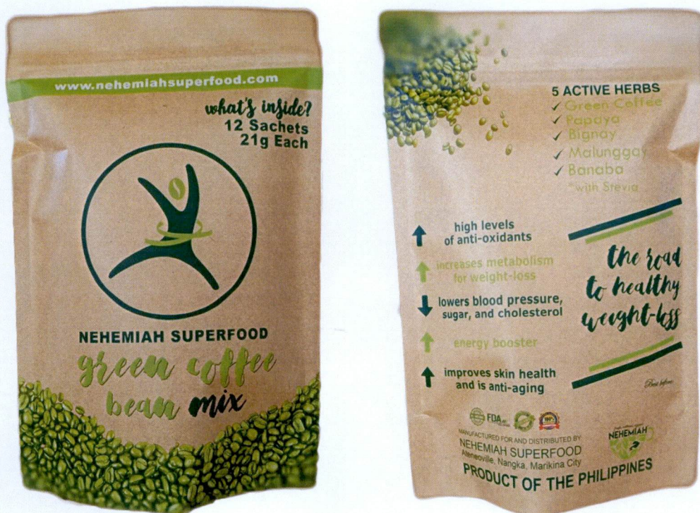
Figure 3. Unregistered NEHEMIAH SUPERFOOD Green Coffee Bean Mix