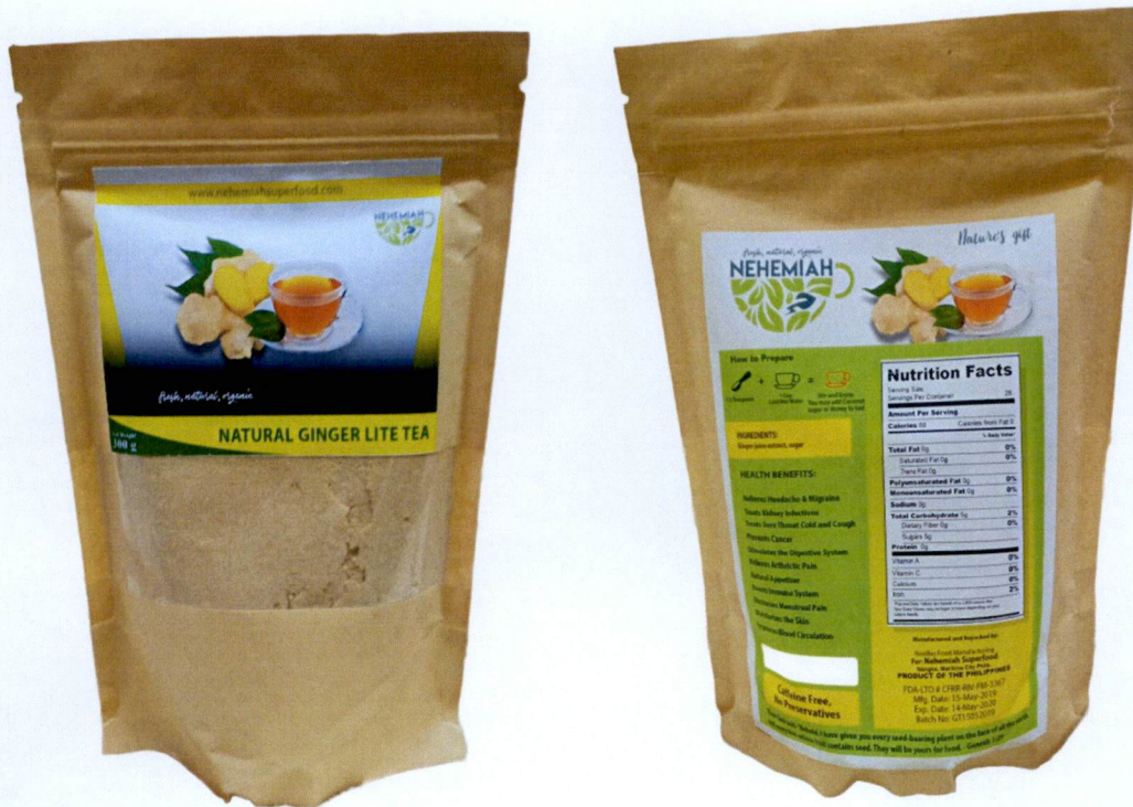
Figure 1. Unregistered NEHEMIAH Natural Ginger Lite Tea

The Food and Drug Administration (FDA) advises the public from purchasing and consuming the following unregistered food products: