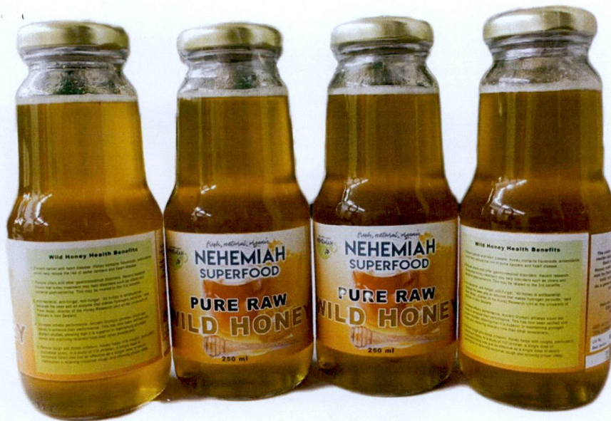
Figure 4. Unregistered NEHEMIAH SUPERFOOD Pure Raw Wild Honey