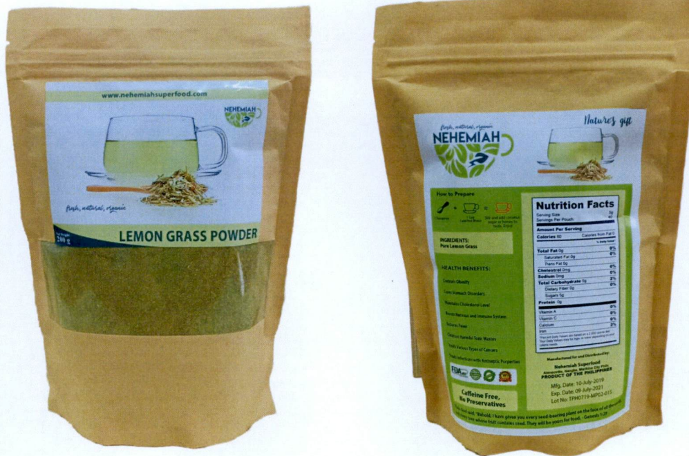
Figure 2. Unregistered NEHEMIAH Lemon Grass Powder