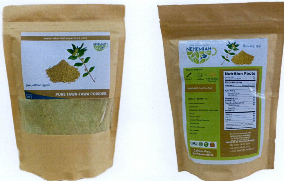
Figure 5. Unregistered NEHEMIAH Pure Tawa-Tawa Powder

The FDA verified through post-marketing surveillance that the abovementioned food products are not authorized and the Certificates of Product Registration (CPR) have not been issued. Pursuant to the Republic Act No. 9711, otherwise known as the “Food and Drug Administration Act of 2009”, the manufacture, importation, exportation, sale, offering for sale, distribution, transfer, non-consumer use, promotion, advertising or sponsorship of health products without the proper authorization is prohibited.