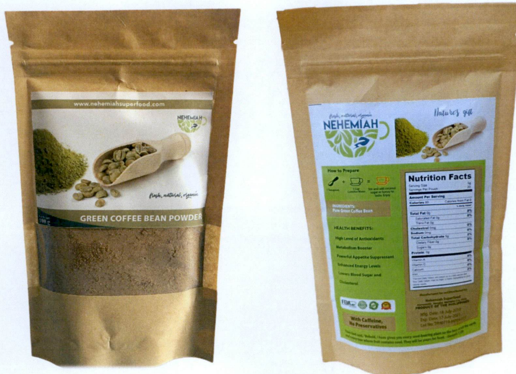
Figure 3. Unregistered NEHEMIAH Green Coffee Bean Powder