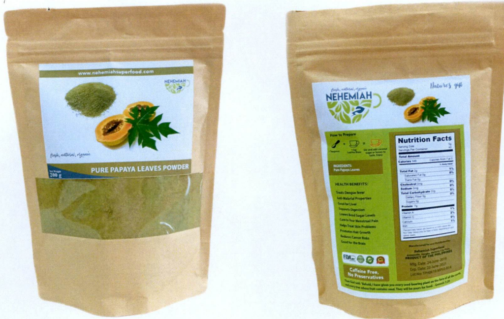
Figure 4. Unregistered NEHEMIAH Pure Papaya Leaves Powder