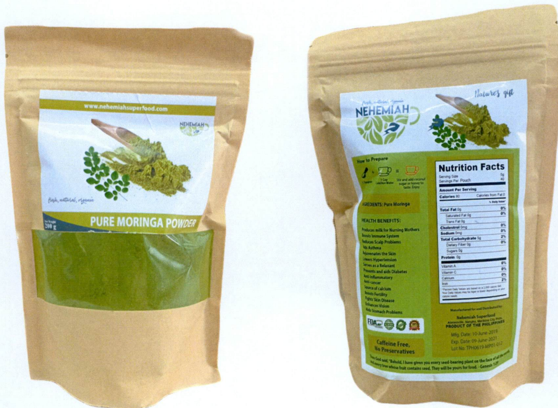
Figure 1. Unregistered NEHEMIAH Pure Moringa Powder

The Food and Drug Administration (FDA) advises the public from purchasing and consuming the following unregistered food products: