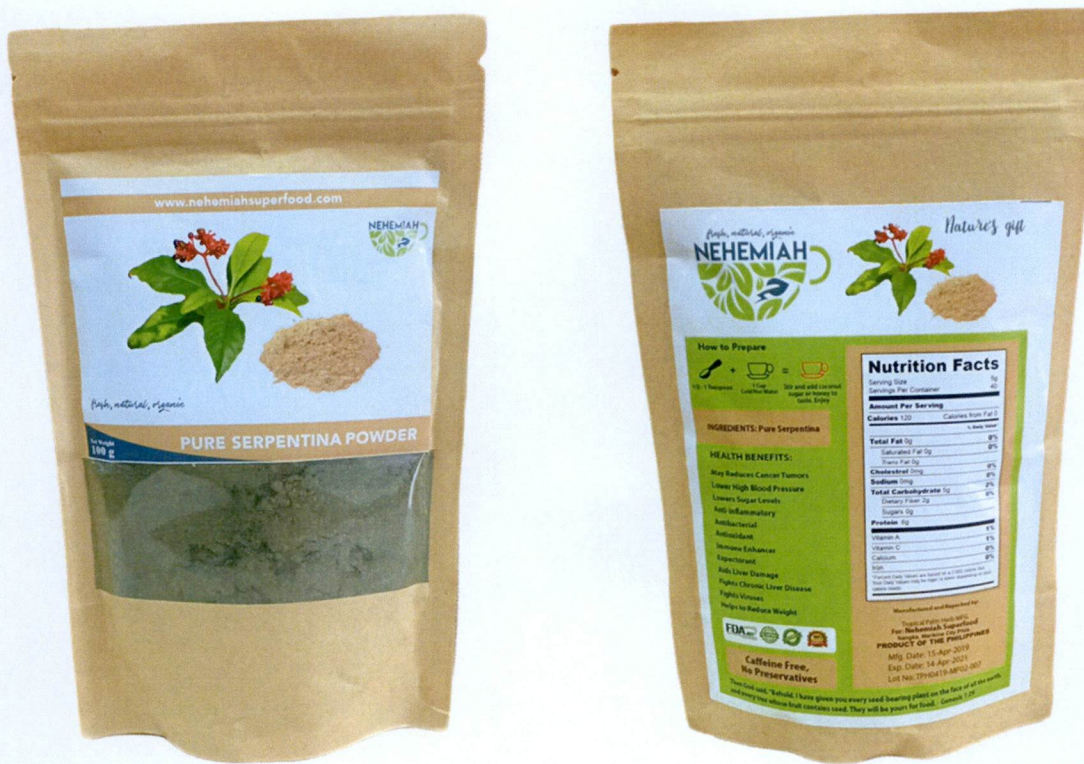
Figure 3. Unregistered NEHEMIAH Pure Serpentina Powder