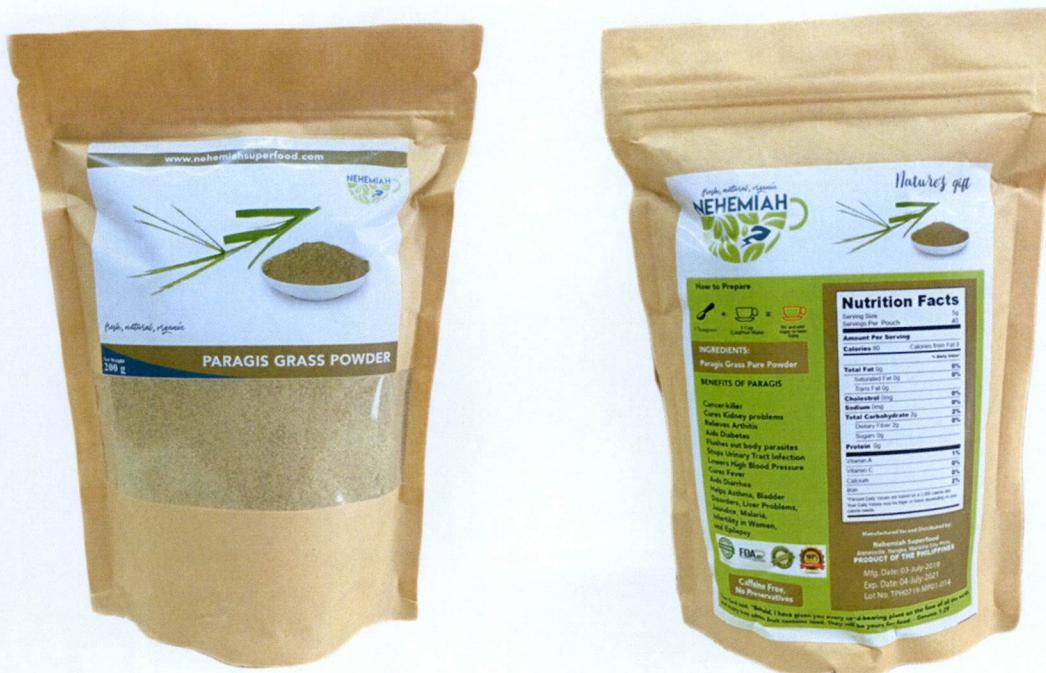
Figure 5. Unregistered NEHEMIAH Paragis Grass Powder

The FDA verified through post-marketing surveillance that the abovementioned food products are not authorized and the Certificates of Product Registration (CPR) have not been issued. Pursuant to the Republic Act No. 9711, otherwise known as the “Food and Drug Administration Act of 2009”, the manufacture, importation, exportation, sale, offering for sale, distribution,