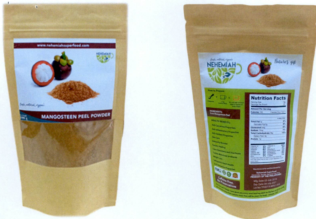
Figure 2. Unregistered NEHEMIAH Mangosteen Peel Powder