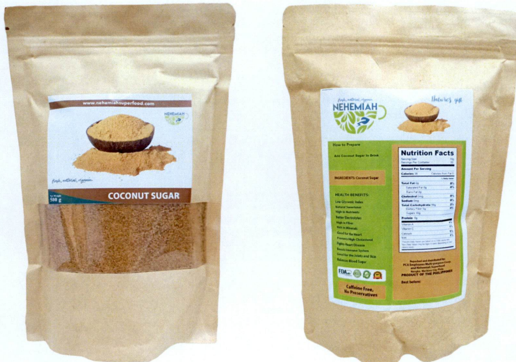
Figure 3. Unregistered NEHEMIAH Coconut Sugar