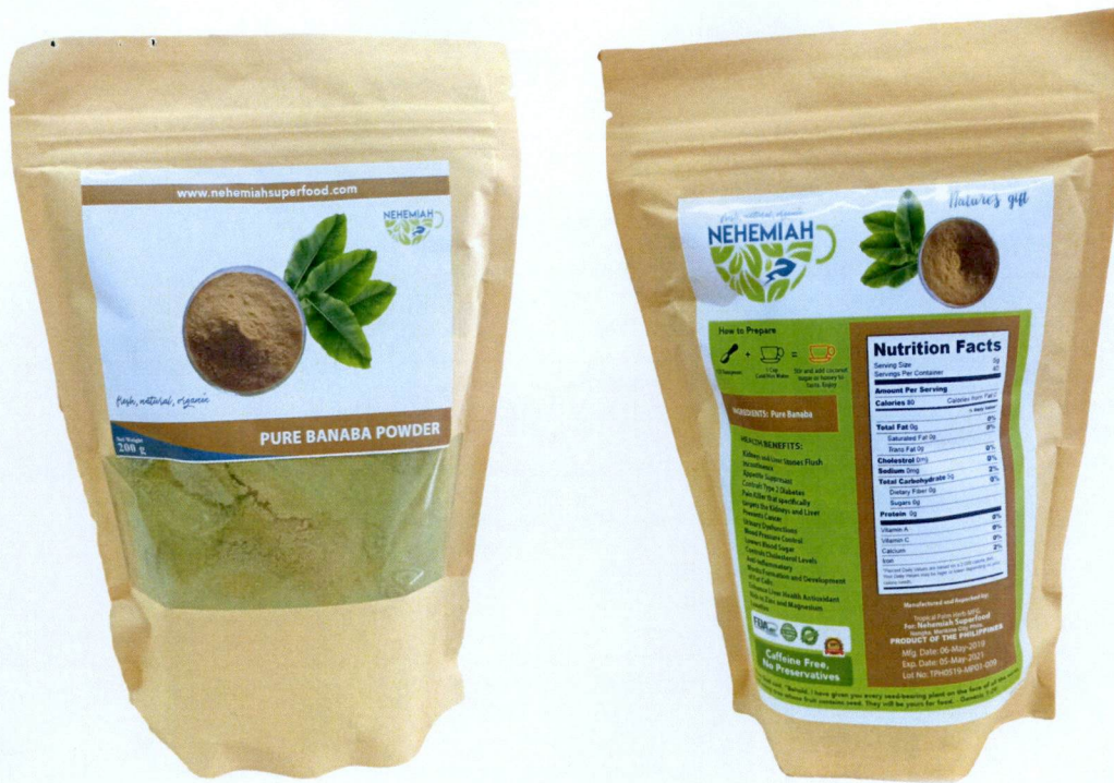
Figure 4. Unregistered NEHEMIAH Pure Banaba Powder