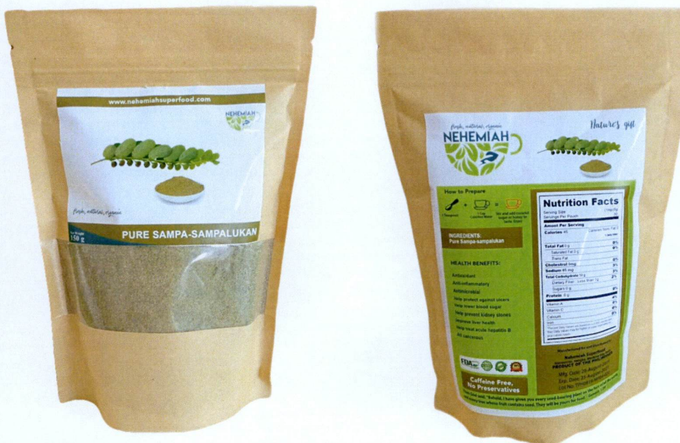
Figure 5. Unregistered NEHEMIAH Pure Sampa-sampalukan Powder

The FDA verified through post-marketing surveillance that the abovementioned food products are not authorized and the Certificates of Product Registration (CPR) have not been issued. Pursuant to the Republic Act No. 9711, otherwise known as the “Food and Drug Administration Act of 2009”, the manufacture, importation, exportation, sale, offering for sale, distribution,