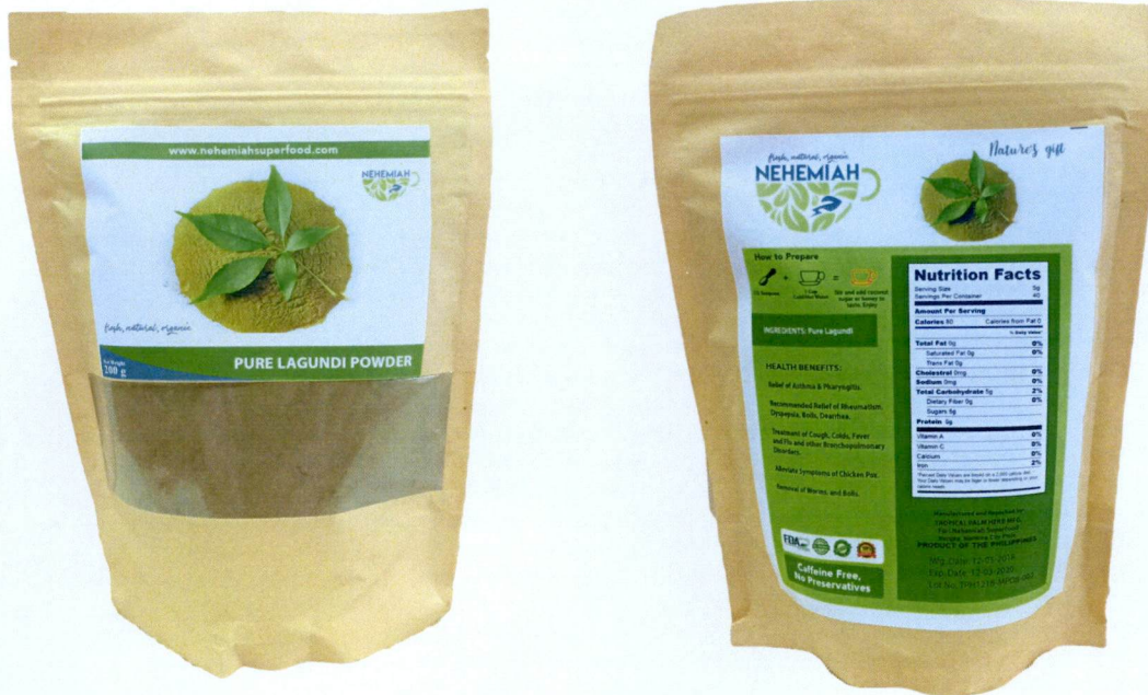
Figure 2. Unregistered NEHEMIAH Pure Lagundi Powder