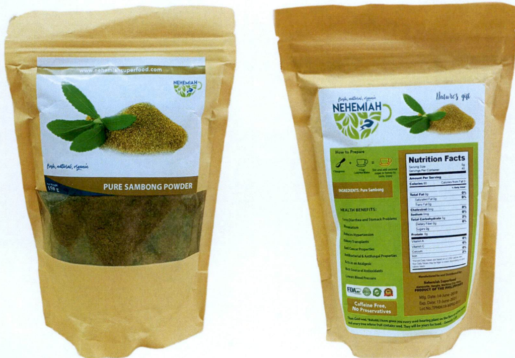
Figure 1. Unregistered NEHEMIAH Pure Sambong Powder

The Food and Drug Administration (FDA) advises the public from purchasing and consuming the following unregistered food products: