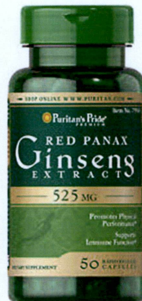
Figure 5. Unregistered PURITAN'S PRIDE Red Panax Ginseng Extract Dietary Supplement

The FDA verified through post-marketing surveillance that the abovementioned food supplements are not registered and the Certificate of Product Registration (CPR) have not yet been issued. Pursuant to the Republic Act No. 9711, otherwise known as the "Food and Drug Administration Act of 2009", the manufacture, importation, exportation, sale, offering for sale, distribution, transfer, non-consumer use, promotion, advertising or sponsorship of health products without the proper authorization is prohibited.