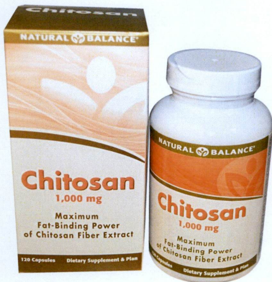
Figure 4. Unregistered NATURAL BALANCE Chitosan Dietary