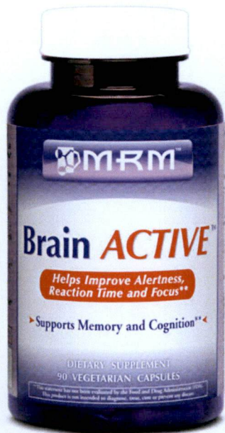
Figure 2. Unregistered MRM Brain Active Supports Memory and Cognition Dietary Supplement