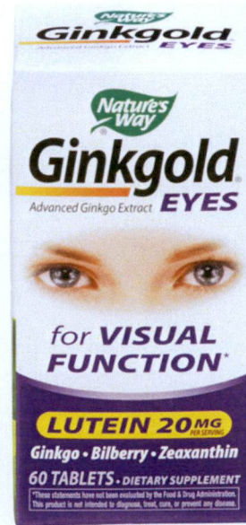
Figure 3. Unregistered NATURE'S WAY Ginkgold Eyes Dietary Supplement