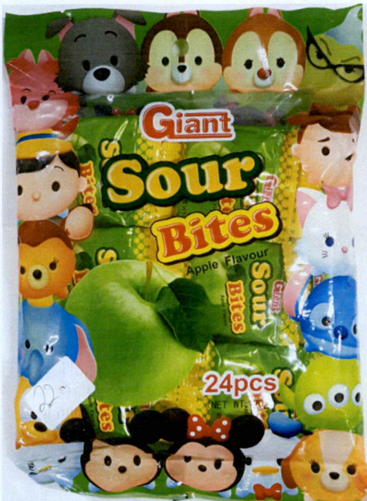
Figure 4. Unregistered GIANT Sour Bites Apple Flavour, Net Wt. 120g (24pcs)