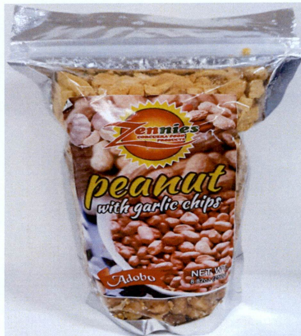
Figure 1. Unregistered ZENNIES CONCUERA FOOD PRODUCTS Peanut with Garlic Chips - Adobo, Net Wt. 8.82oz (250g)

The Food and Drug Administration (FDA) warns the public from purchasing and consuming the following unregistered food products: