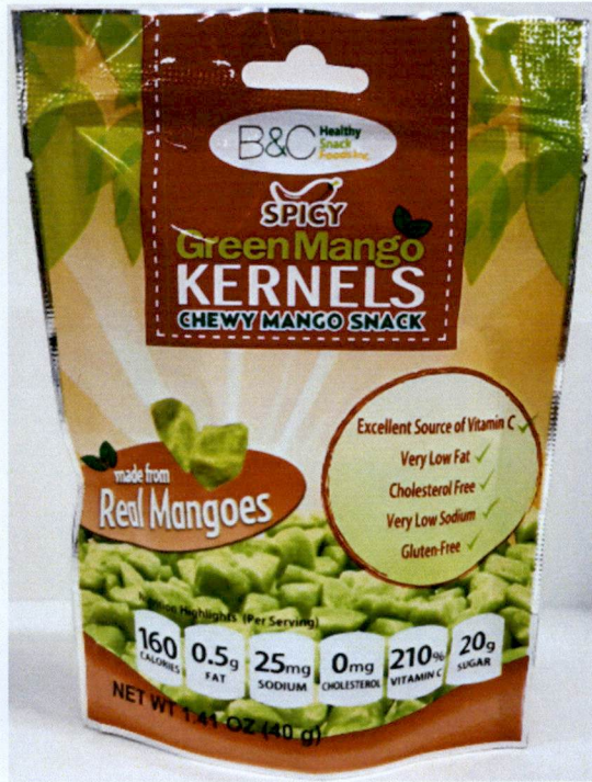
Figure 3. Unregistered B&C HEALTHY SNACK Green Mango Kernels (Spicy) - Chewy Coconut Snack, Net Wt. 1.41oz (40g)