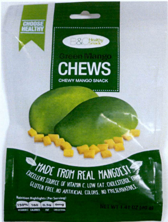
Figure 2. Unregistered B&C HEALTHY SNACK Green Mango Chews – Chewy Mango Snack, Net Wt. 1.41oz (40g)