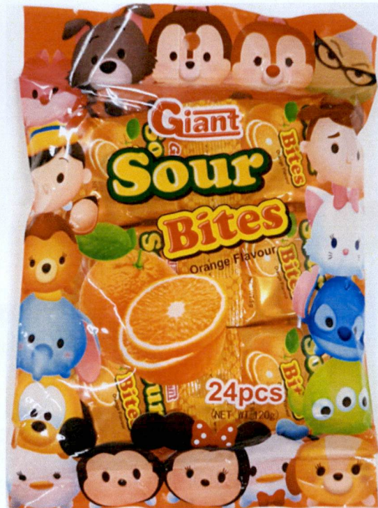
Figure 5. Unregistered GIANT Sour Bites Orange Flavour, Net Wt. 120g (24pcs)