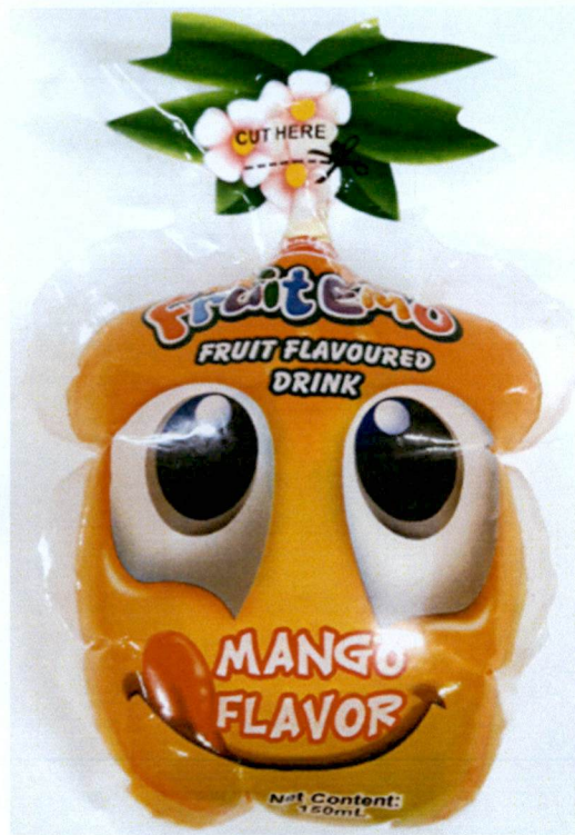
Figure 4. Unregistered YANYAN Fruit Emo Fruit Flavoured Mango Flavor, Net Content 150ml