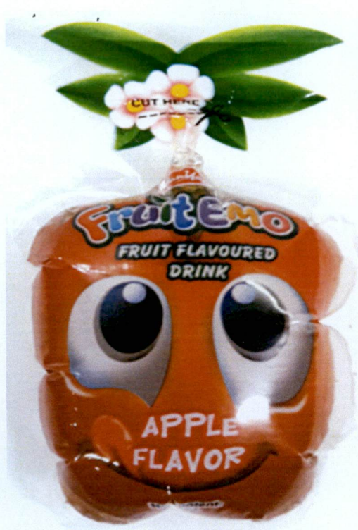
Figure 2. Unregistered YANYAN Fruit Emo Fruit Flavoured Apple Flavor, Net Content 150ml