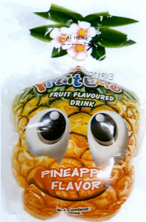
Figure 3. Unregistered YANYAN Fruit Emo Fruit Flavoured Pineapple Flavor Passion Net Content 150ml