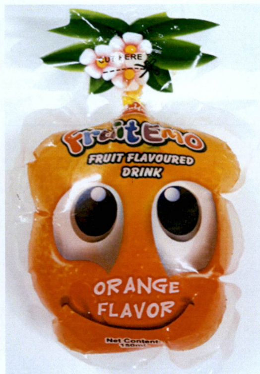
Figure 2. Unregistered YANYAN Emo Fruit Fruit Flavoured Orange Flavor, Net Content 150ml