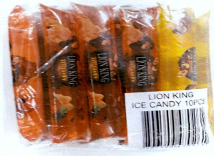
Figure 1. Unregistered HARVEY LION KING Ice Candy, 10 pcs

The Food and Drug Administration (FDA) warns the public from purchasing and consuming the following unregistered food products: